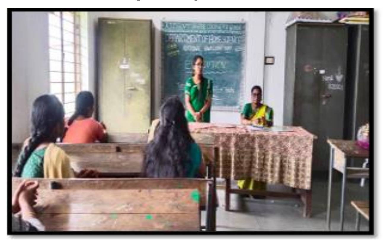
Prizes sponsored by Lion's Club Sankalp for the winners