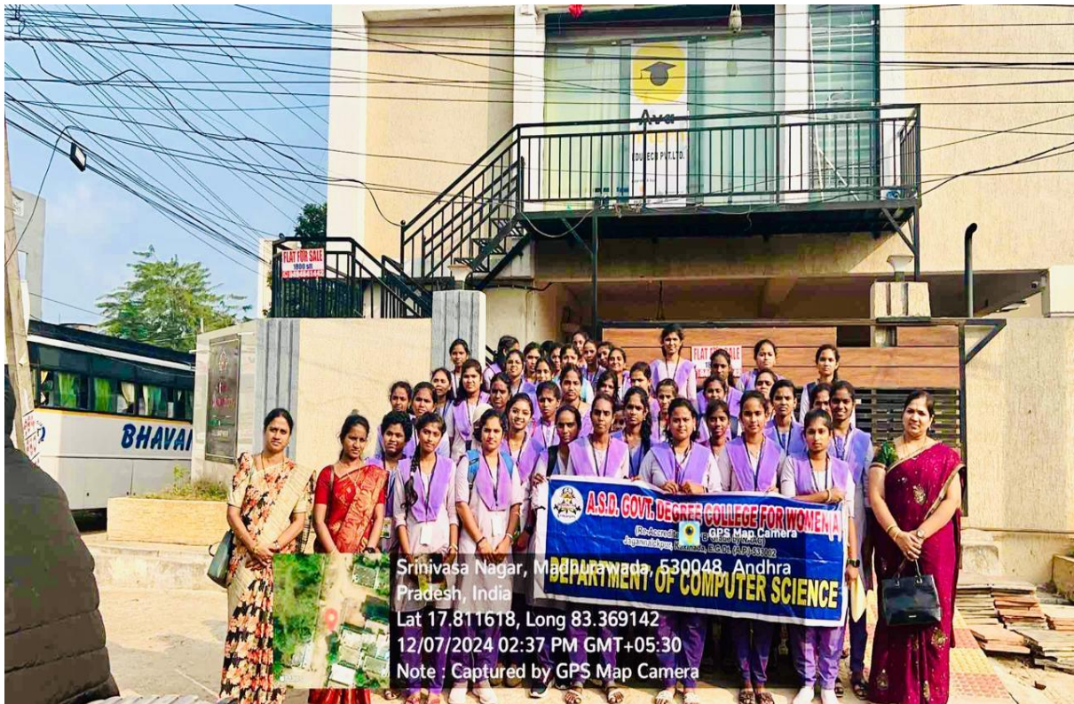
Students and Staff at Ava Intern Edutech Pvt. Ltd., Visakhapatnam