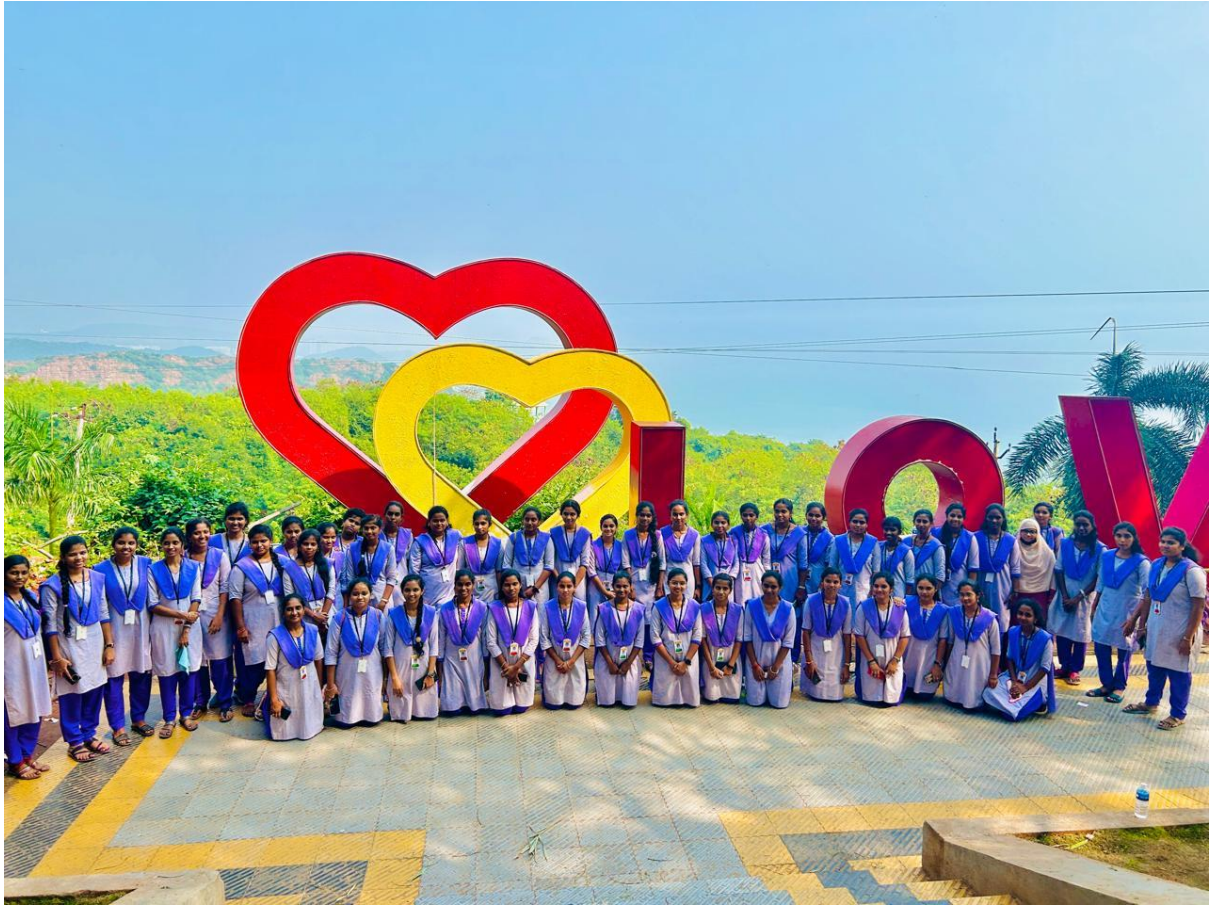
Students of II B.Sc.(CS) and II B.Com.(CA) at Kailasagiri