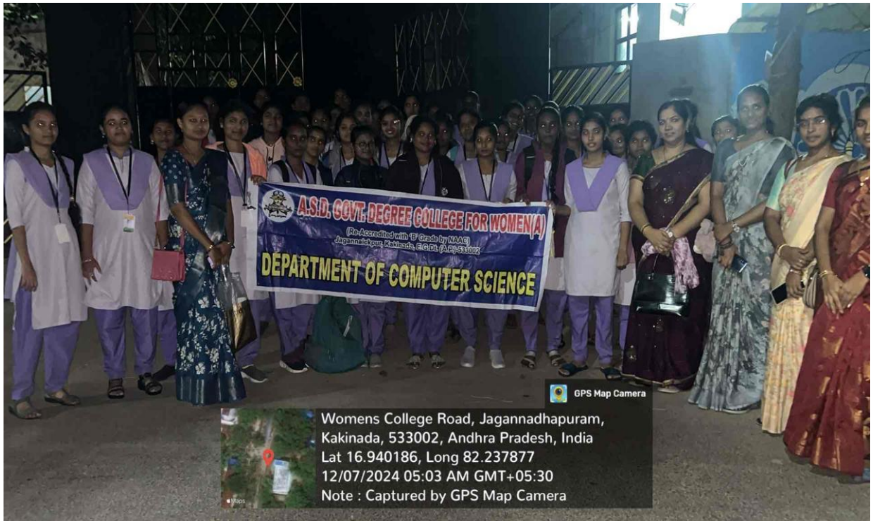
Students and staff members started from college at 5 AM on 07-12-2024 to visit Ava Intern Edutech. Pvt. Ltd., Visakhapatnam