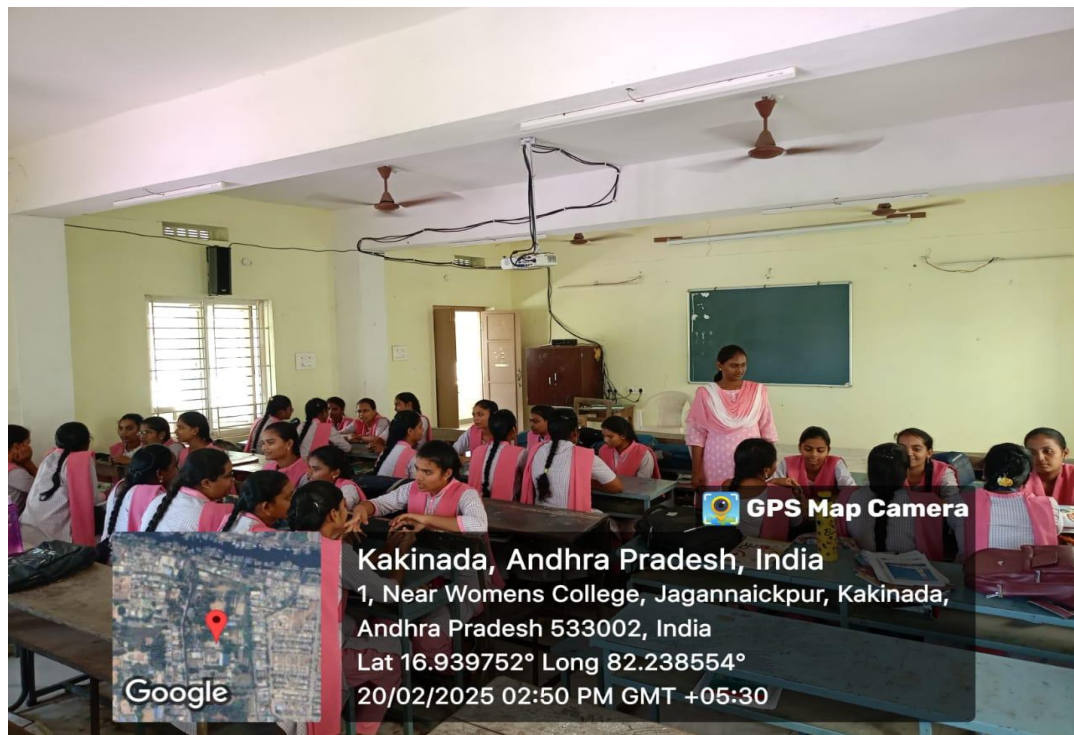
All the Students expressing their views with their groups