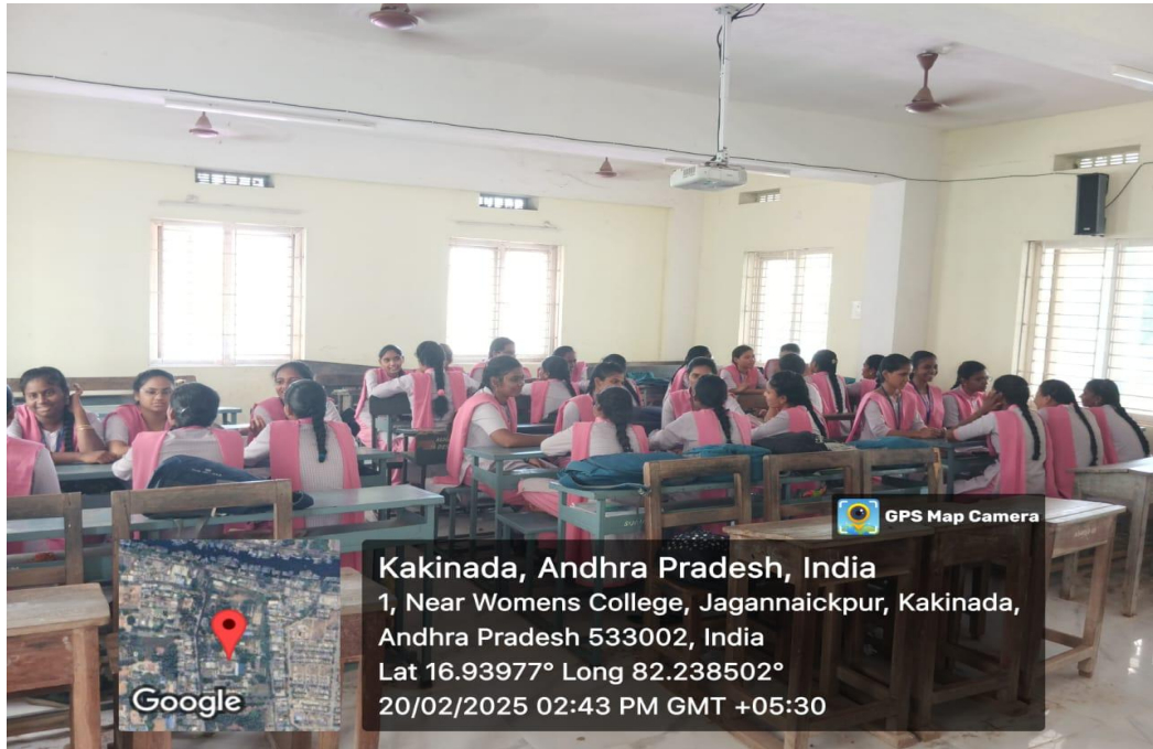
Students expressing their views in Group Discussion