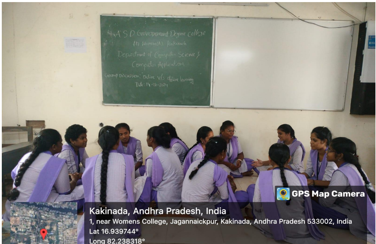
“Students sharing their view on Group Discussion”