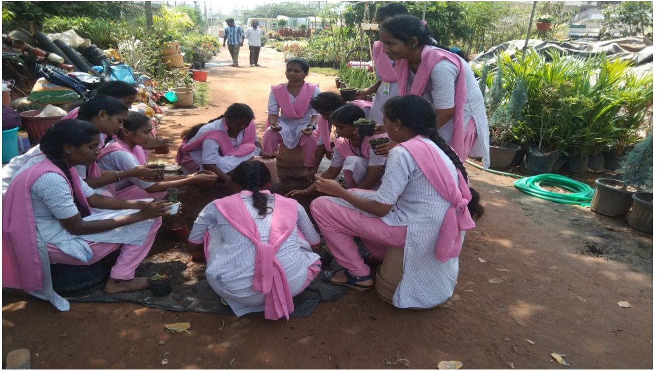
Students making Propagation of various plants in their internship