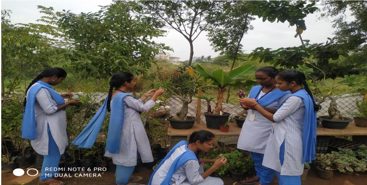
Students Learning about Cultivation of Bonsai