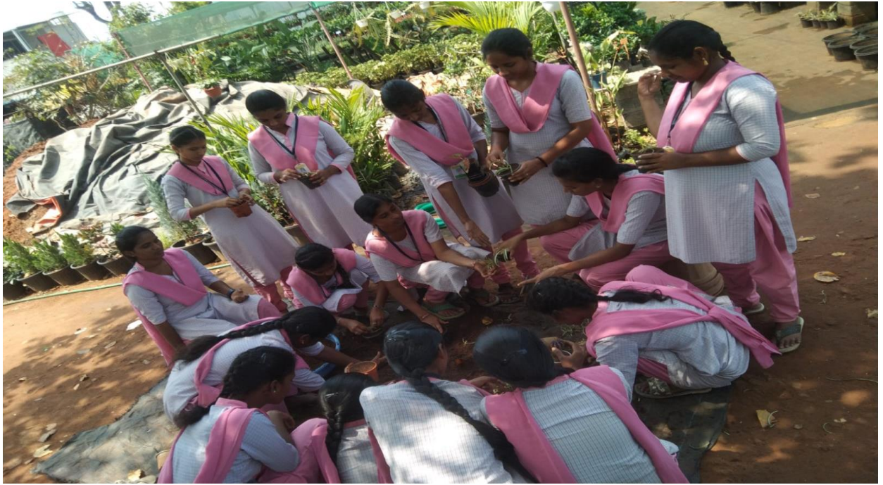
Students preparing potting mixture