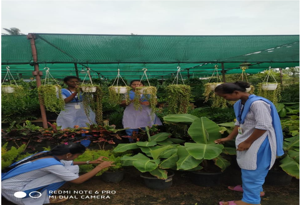
Students learning about growth condition of various plants under Shade Nets