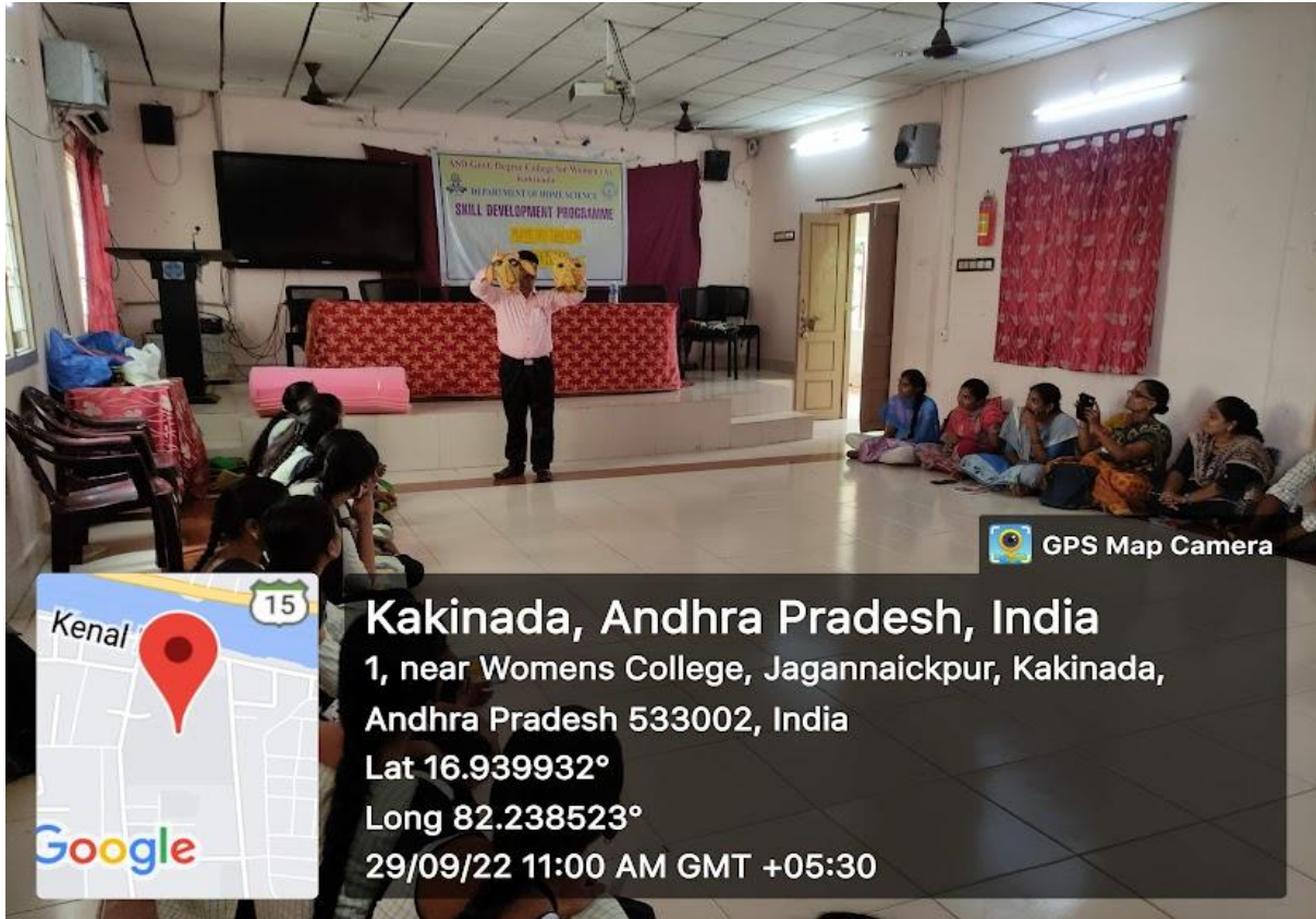
Participants of the programme