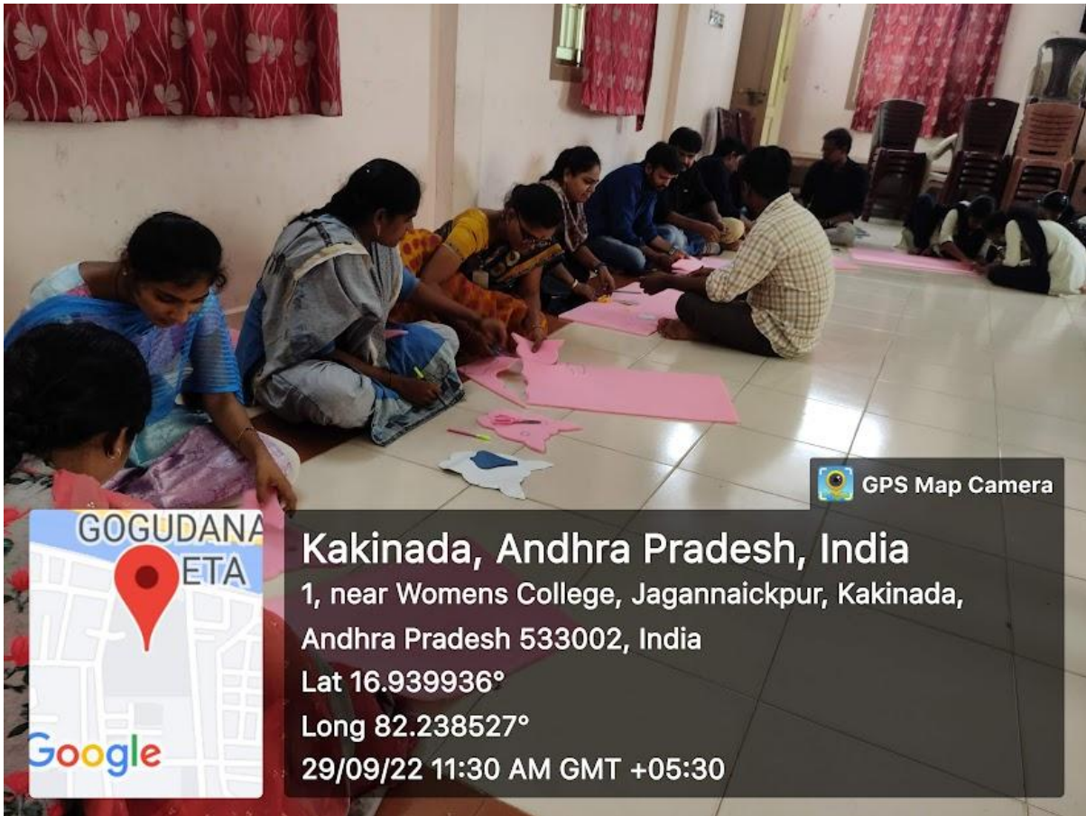
Puppets prepared by the participants