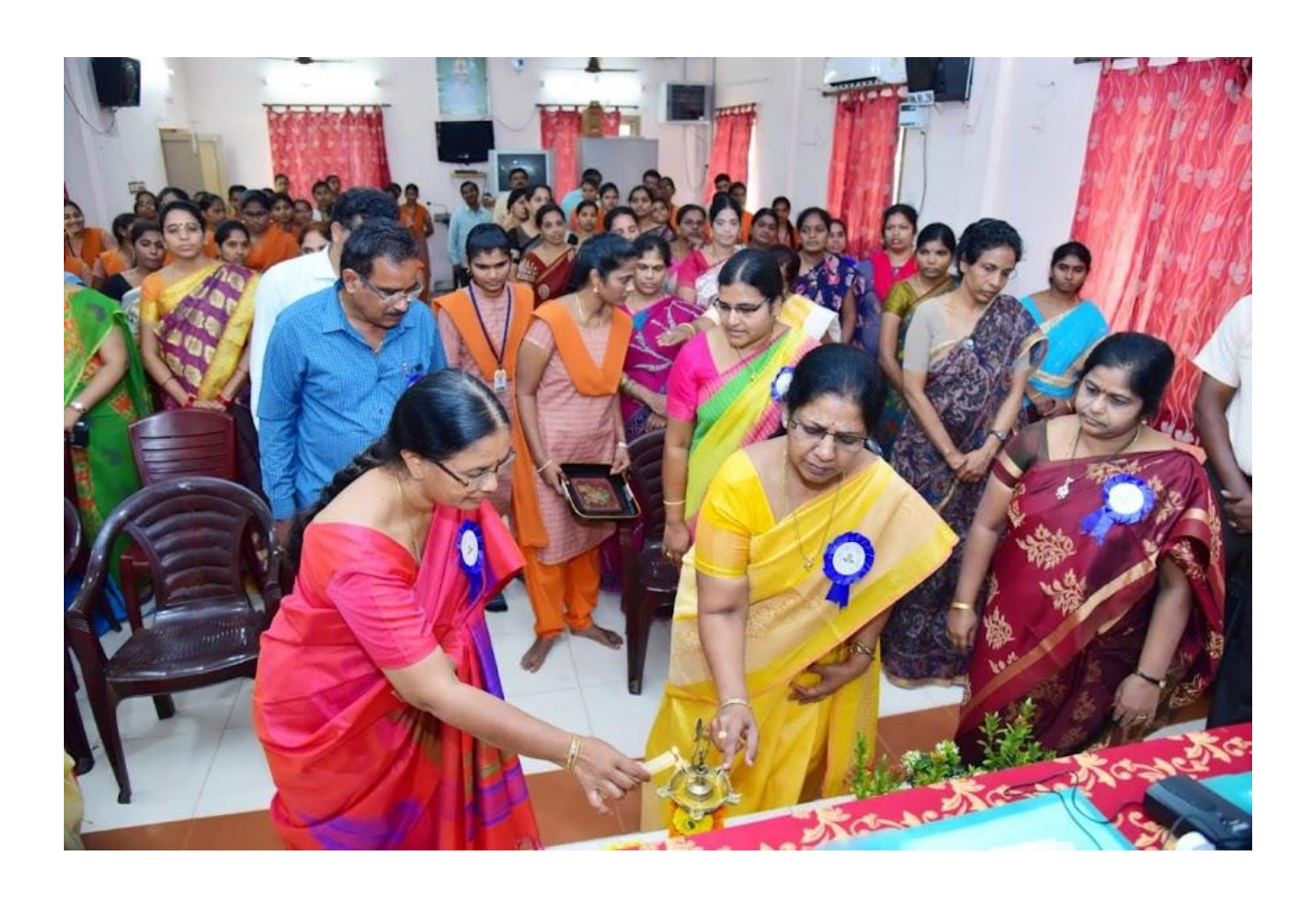
Lighting of the Lamp during the inauguration of the workshop