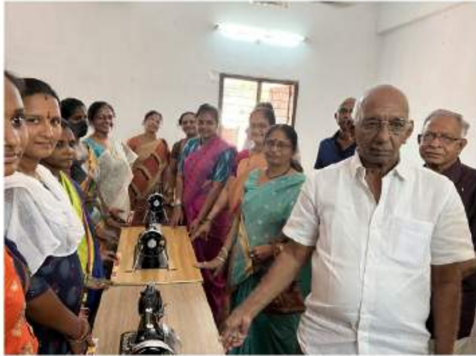
Inauguration of Skill Hub on 7 th March, 2022 by Municipal Commissioner, KMC, Kakinada