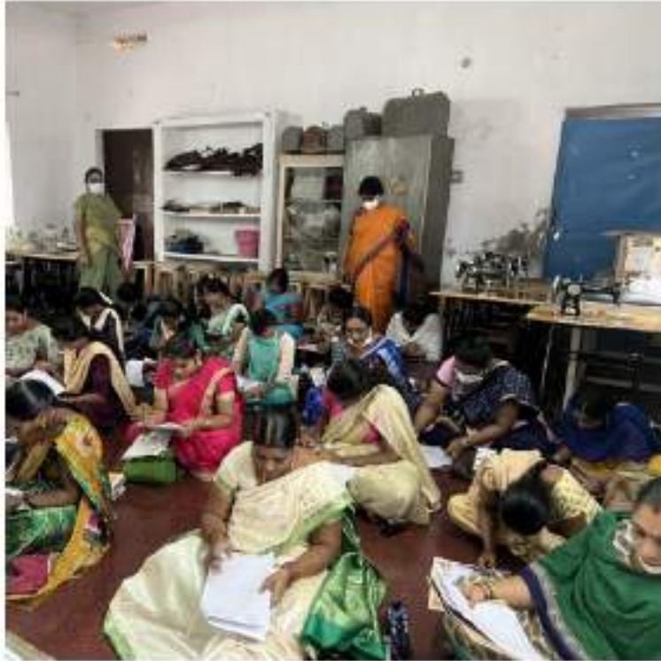
Assessment for Trainees of "Self- Employed Tailor" " course under Skill Hub Initiative .