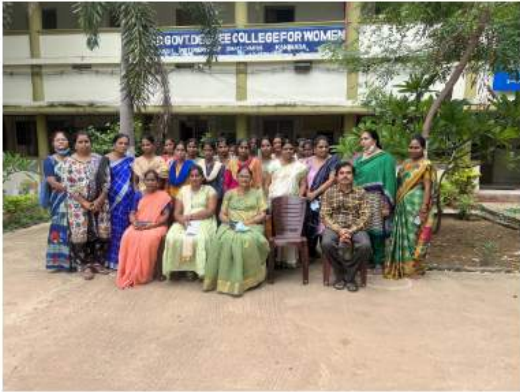
Assessment conducted on 04 th July, 2022 by IQAG