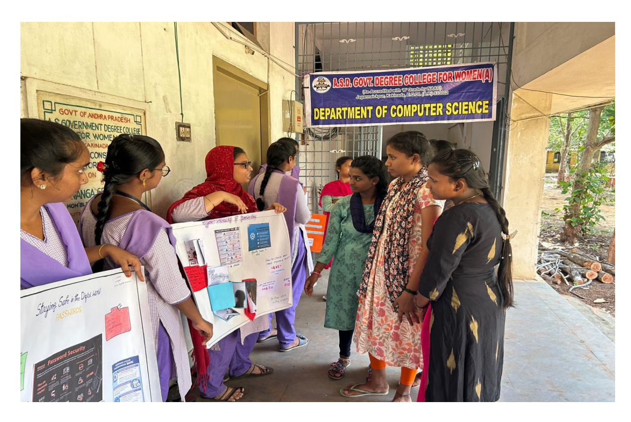
Exhibition of Posters by the participants to the students of the AS Junior College to spread Awareness on Cyber Security