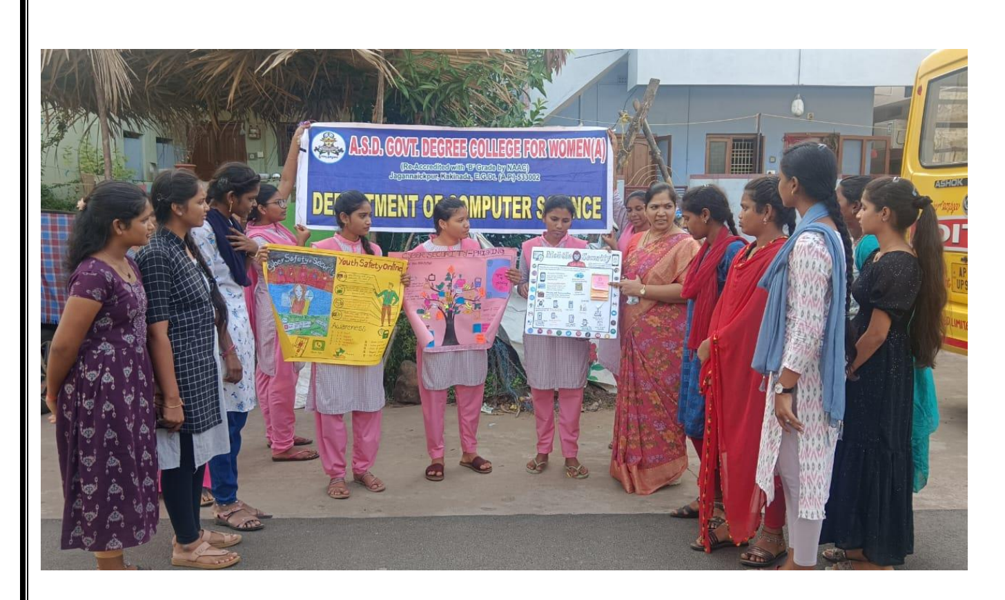
Faculty and Students explaining about Cyber threats and attacks to public