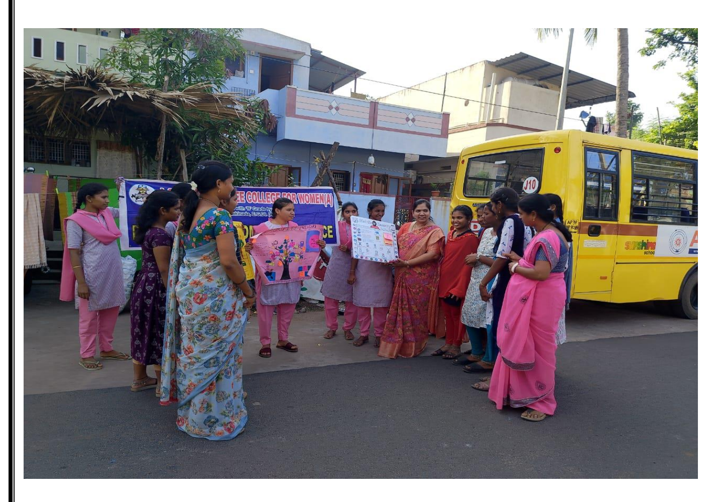
Faculty and Students explaining about Cyber threats and attacks to public