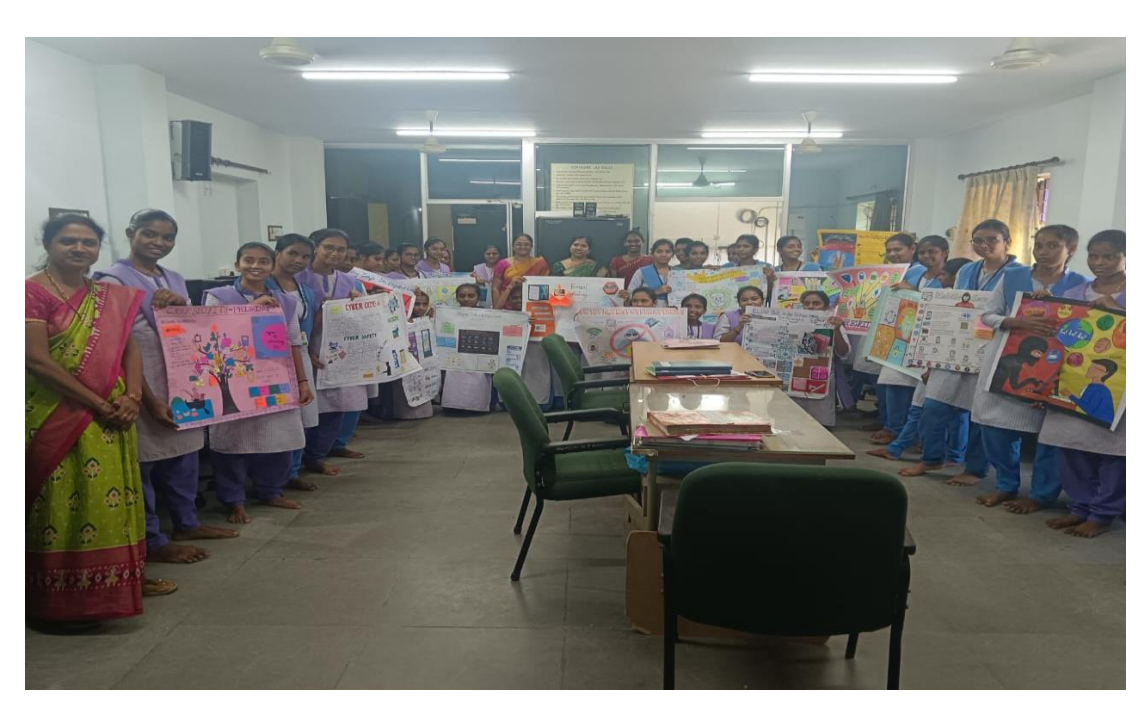
Student participants with Posters along with Principal & Staff