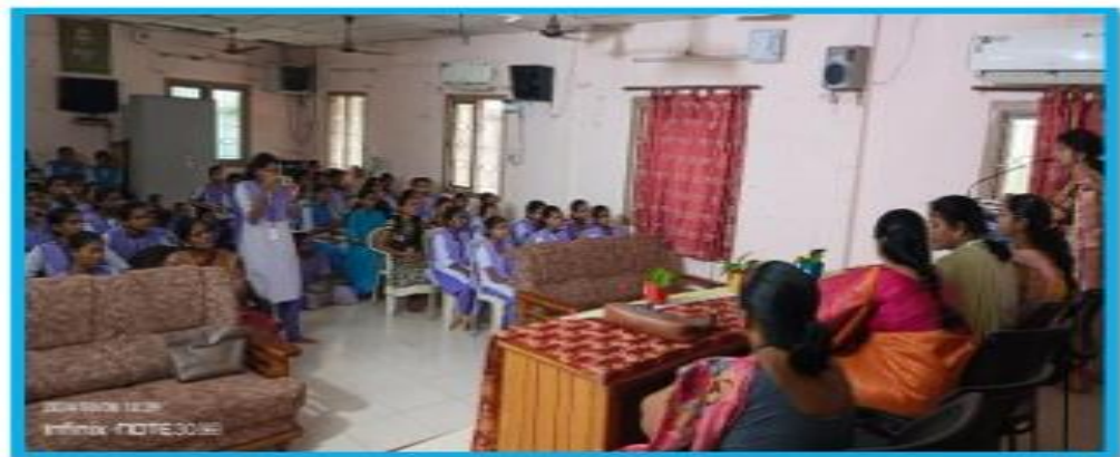
Health Committee conducted a Health Checkup camp for the students and staff on 8-8-2024 in collaboration with Health department