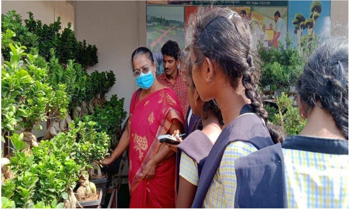
Students Observing Bonsai Plants