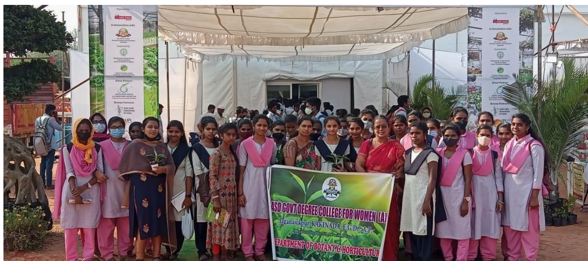
Our Dept Students at Nursery & Landscape Expo at Govt Arts College (A) Rajahmahendravaram

Faculty & Students of the Department visited Nursery & Landscape Expo 2022 organised by Agritech ,Andhrapradesh at Govt. Arts College Autonomous Rajahmahendravaram.on 16-03-2022 Students learnt about various plants best suitable for Gardening and Bonsai making and also for Agricultural purpose