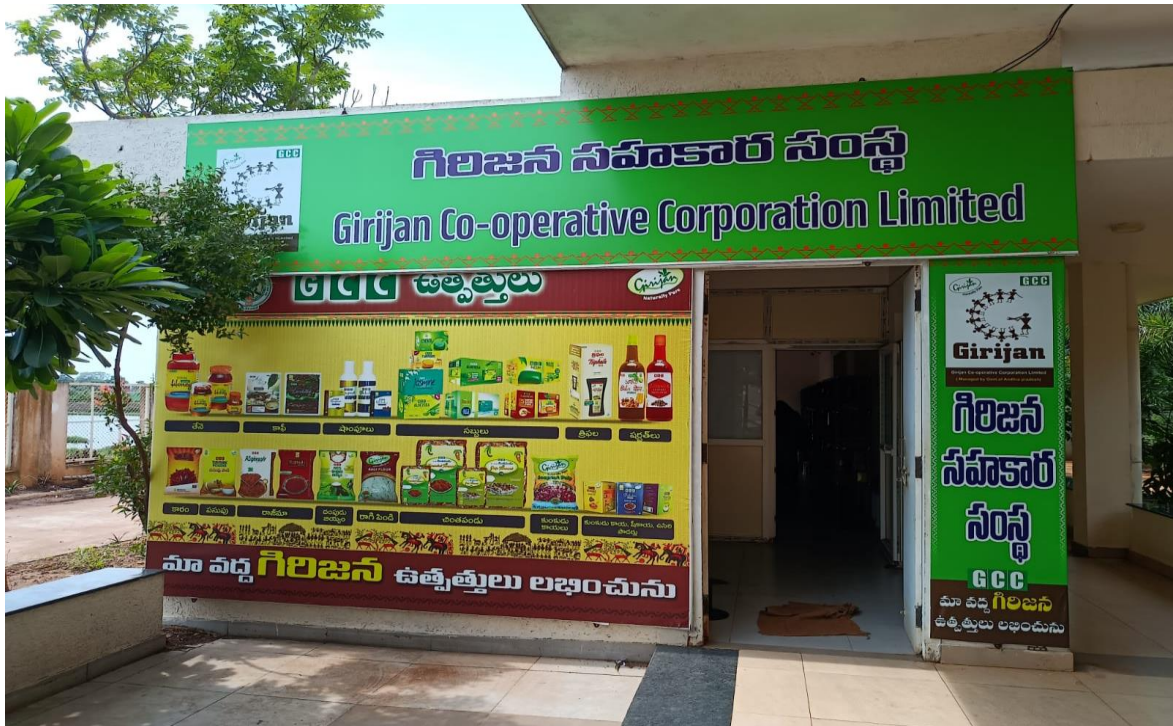
Faculty & Students Visiting Stall kept by Girijan Cooperative Limited