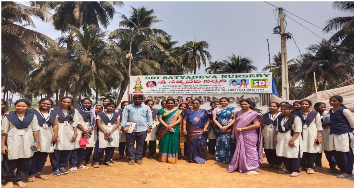
Students and Faculty near Satya Deva Nursery