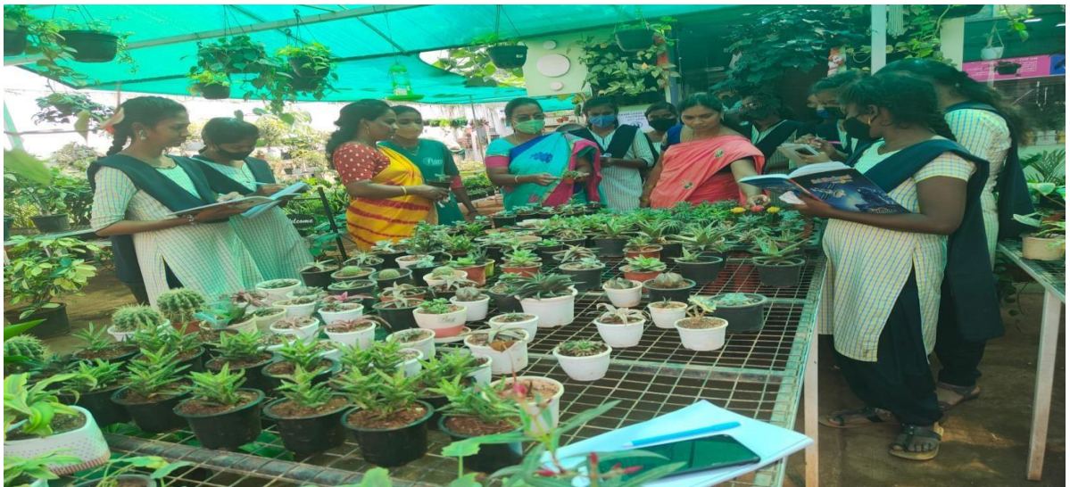
Faculty & Students of the Department visiting Local Nurseries in Kakinada

Faculty of the Dept & Students of CBHT group visited local nurseries and olericulture fields in Sarpavaram, Kakinada on 19.02.2022. In this field visit, students learnt about various propagation techniques, different tools used in Nurseries and cultivation of Bonsai varieties and Succulents etc. In Sarpavaram olericulture fields, students learnt about various cultivation practices to be followed while cultivating different vegetable crops, measures to be taken while controlling pests & diseases attacking various vegetable crops.