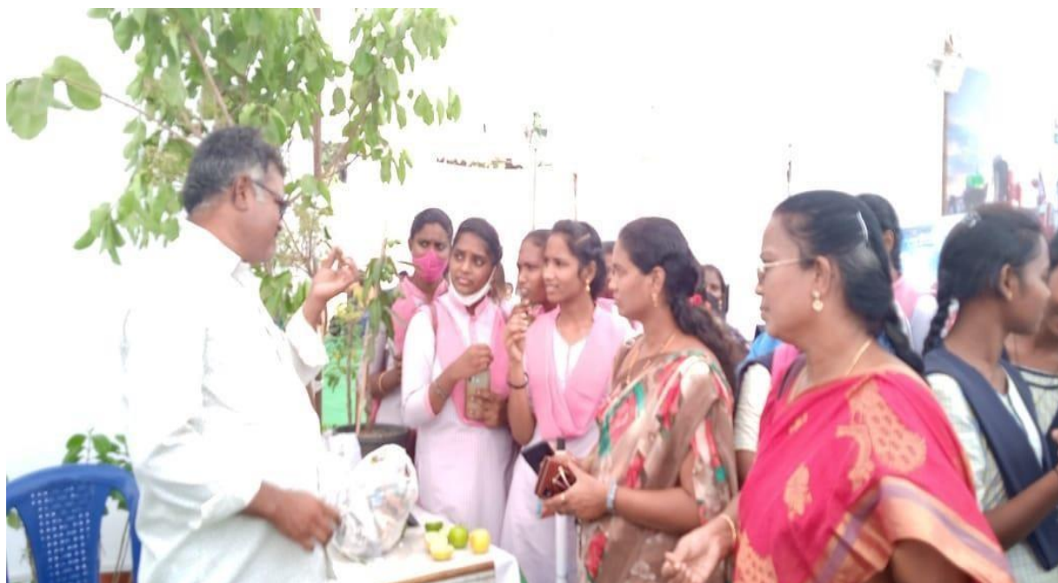
Students Learning About the growth Pattern & Yield of various Fruit Yielding plan