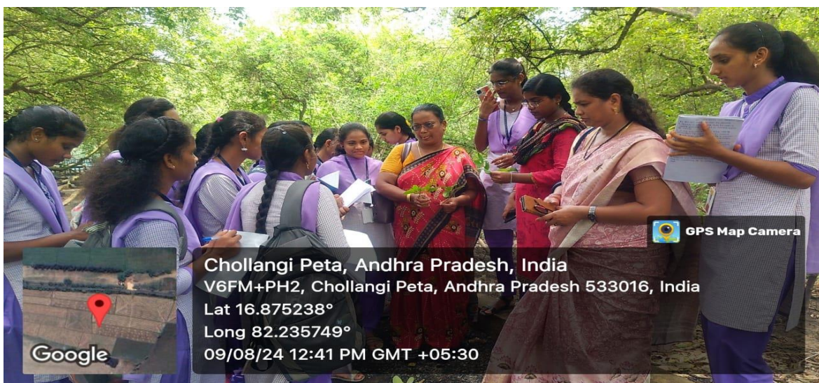
Faculty explaining about Mangrove Diversity