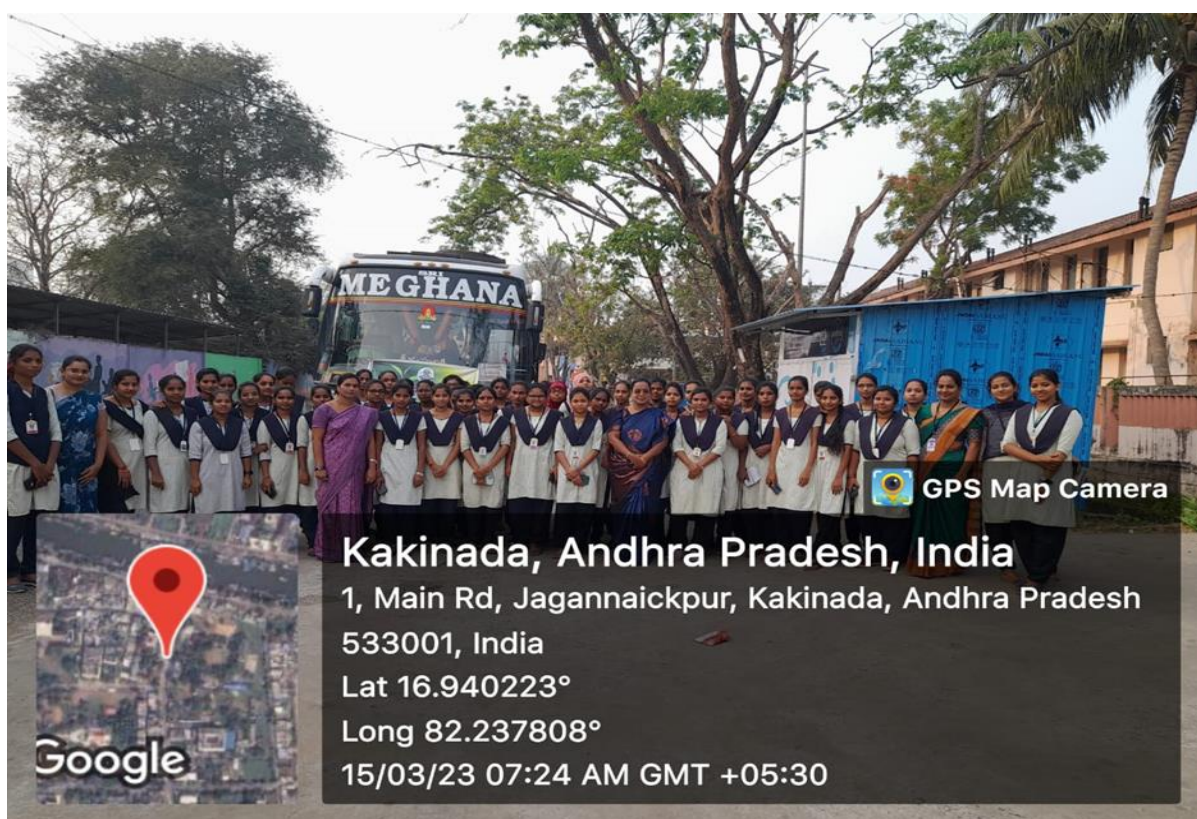
Students and Faculty near College gate before starting to Field Trip