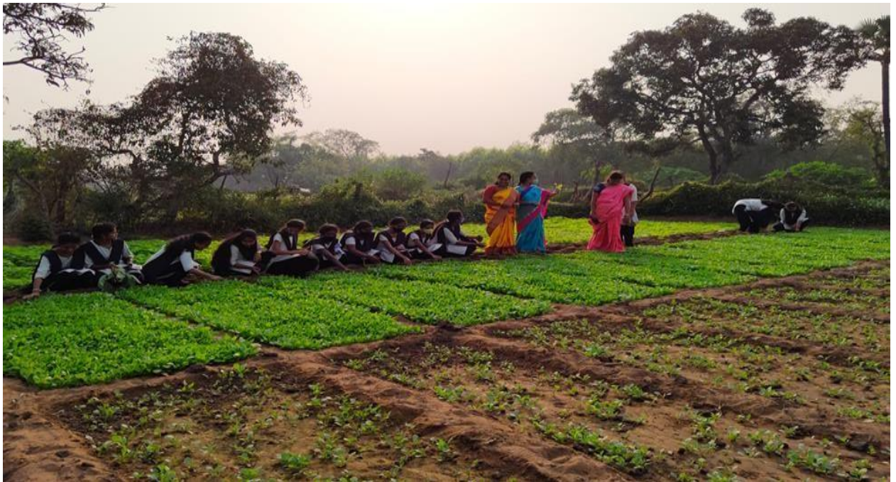
Cultivation of Leafy Vegetables