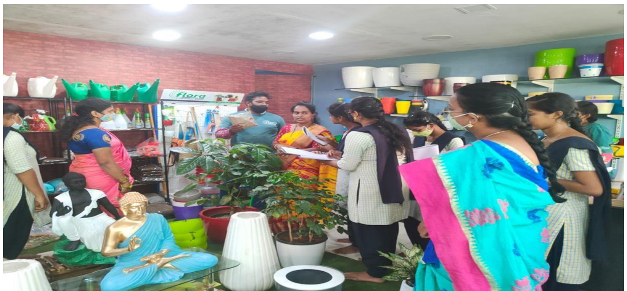
Awareness is given to the students about various containers and fertilizers used in Nurseries