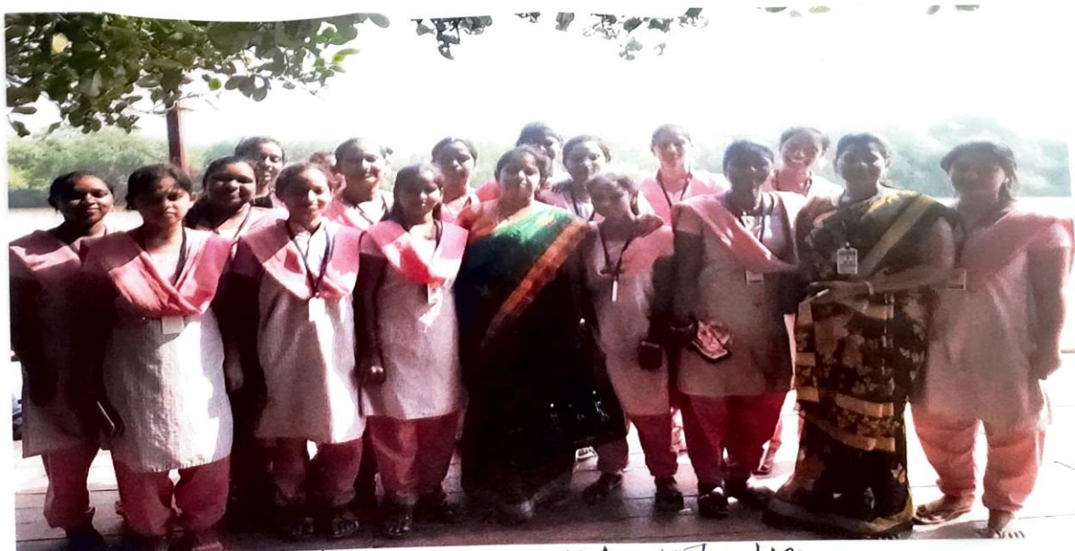
Faculty and students visiting Coringa Bird festival