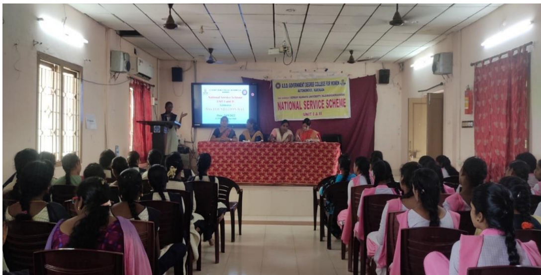
NSS Volunteers participating in Just A Minute Competition