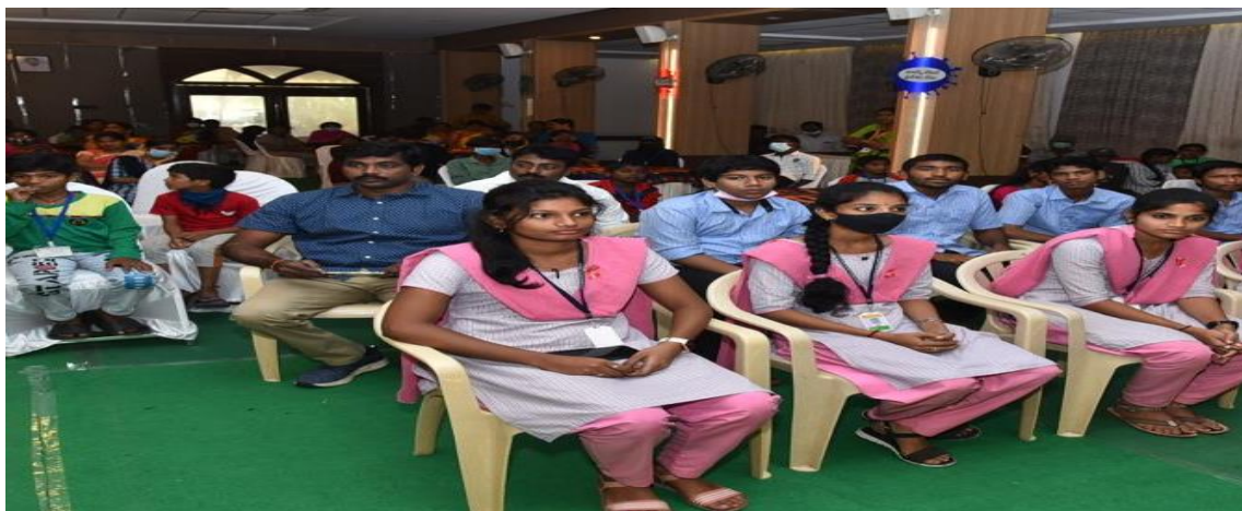
Action photographs of NSS Volunteers receiving prizes from Collector Kruthika Shukla Madam. Unit 1&2 conducting Rally to create awareness on International AIDS Day on 1/12/2022