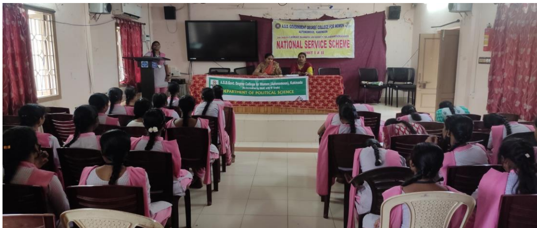
NSS volunteers and Students participating in Elocution competition .

Constitution Pledge was taken on the day at the time assembly. Essay Writing Competition on the topic “contribution of Dr. B.R Ambedkar to Indian Constitution” was conducted also Conducted