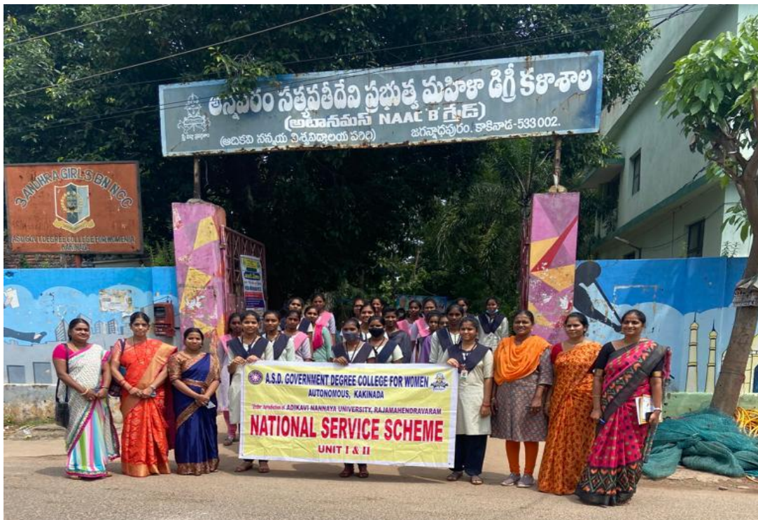
NSS Volunteers Participating in Rally on importance of Women Education.