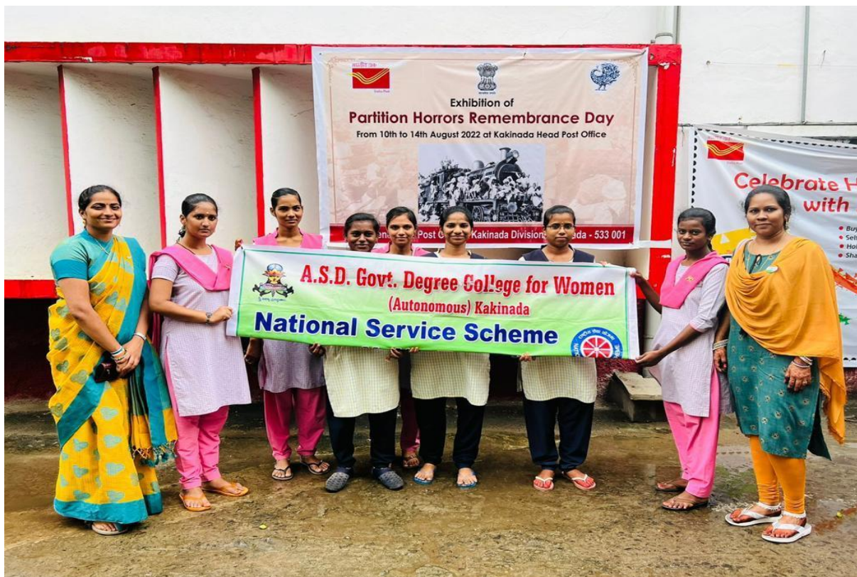
Action Photographs volunteers at Post Office Exhibition.