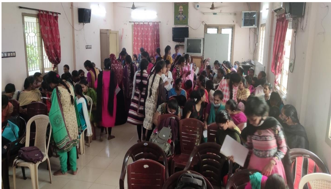
Students Participating in interactive games