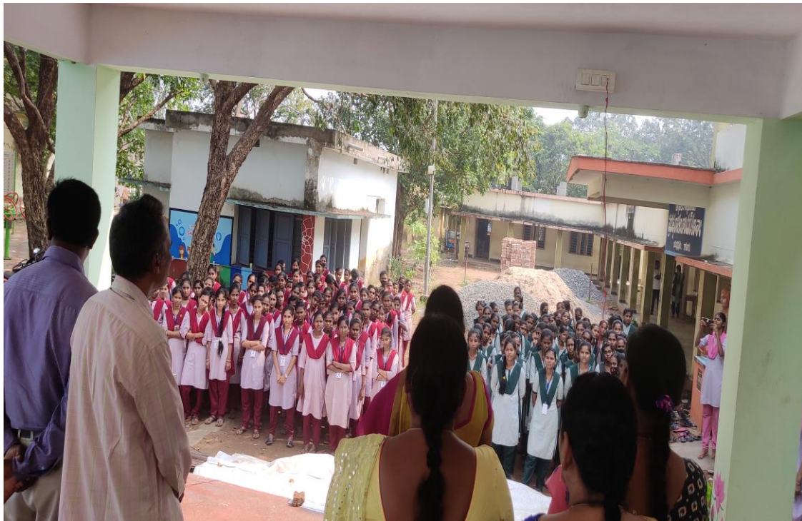
Action photographs of Quiz Competition at ASD Junior college for women and Pens Distribution to the winners.