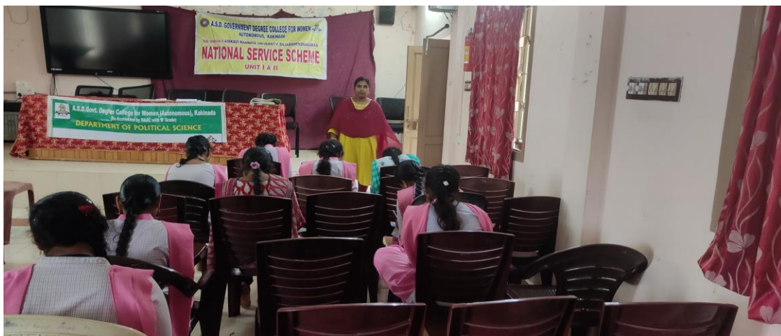
NSS volunteers and Students participating in Essay competition