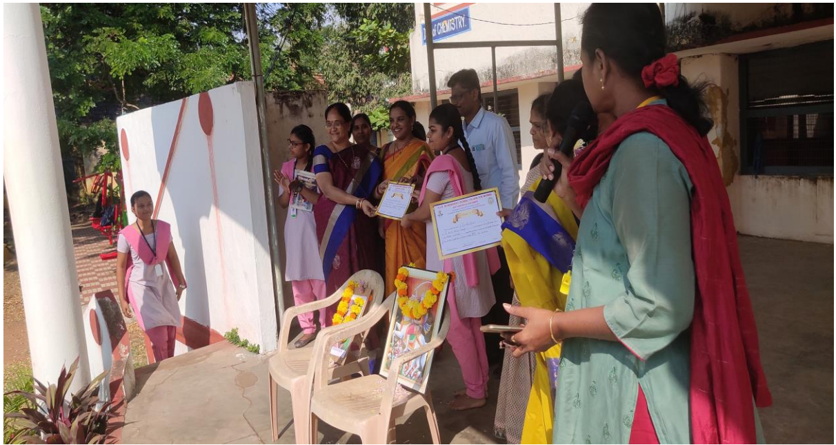
Action photographs of Prize Distribution to the winners and Constitution pledge at assembly on 26/11/2022