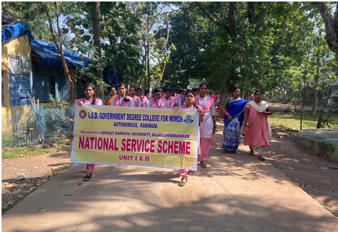
NSS volunteers Participating in Rally to create awareness on AIDS