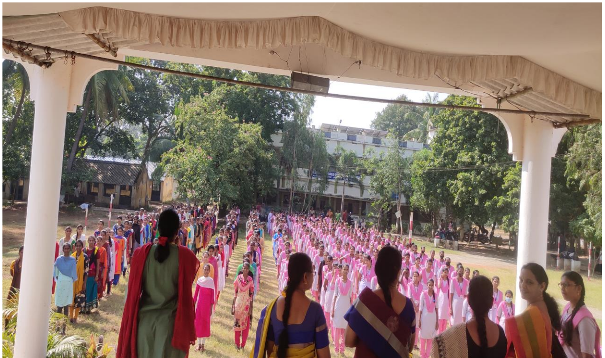
Action photographs of Preamble Pledge being taken On National Constitution Day