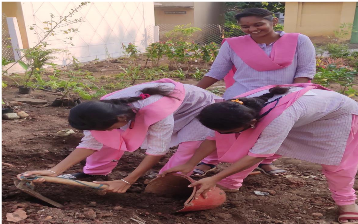
Action photographs of NSS Volunteers spreading the manure and arranging the pots in garden.