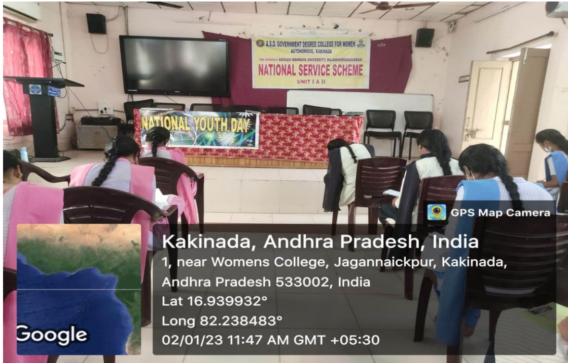
Students Participating in Essay Competition on Relevance of swami Vivekananda Ideas for today's Youth