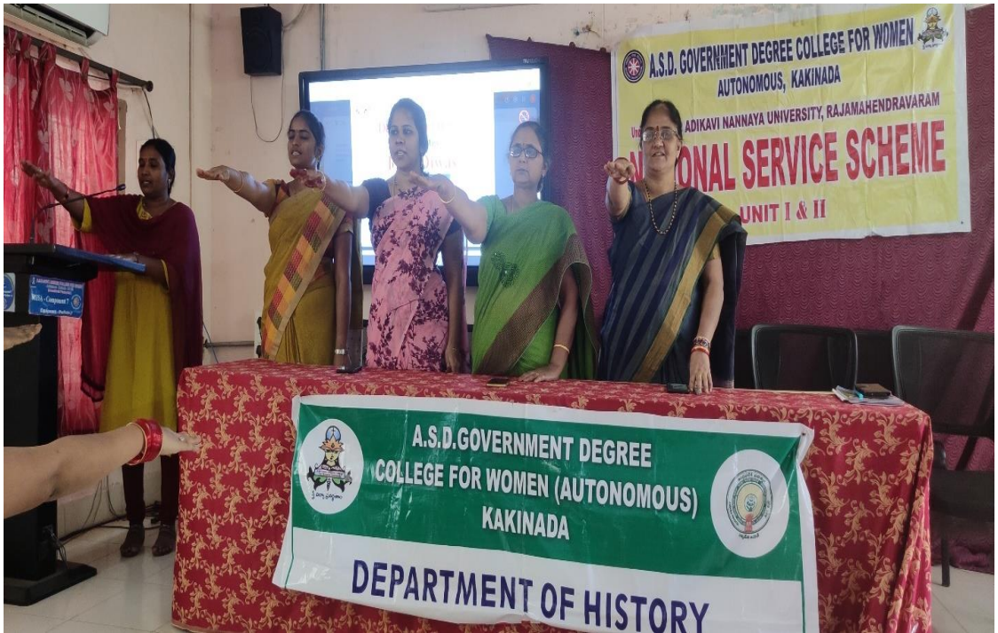
Principal, NSS Programme Officers and NSS volunteers taking unity Pledge