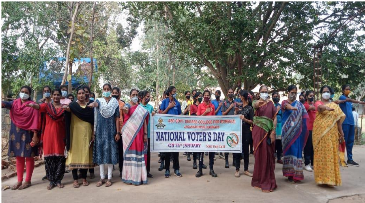
Action Photographs of NSS volunteers taking pledge to vote impartially

NSS volunteers actively participated in taking the oath.