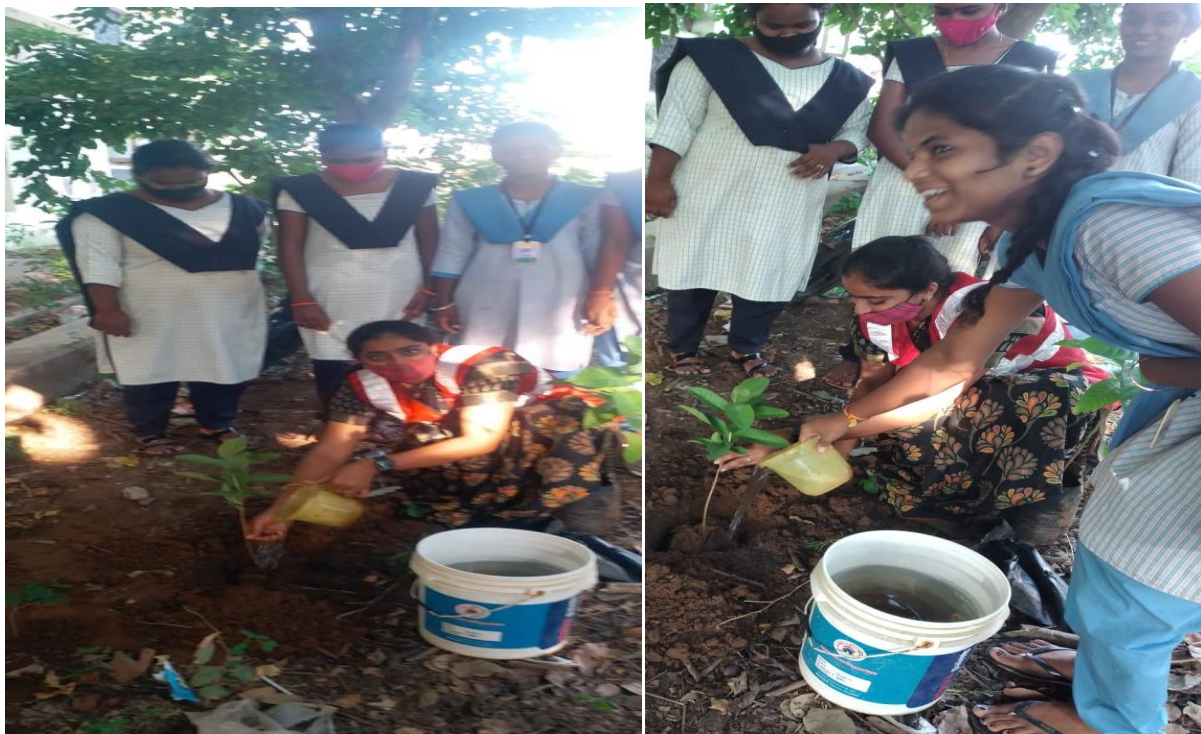
Action Photographs of Plantation drive on 22.10. 2021