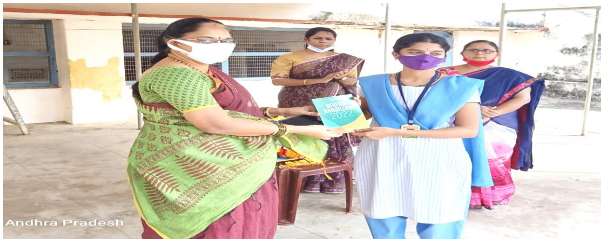
Action photographs of Prize Distribution to the winners