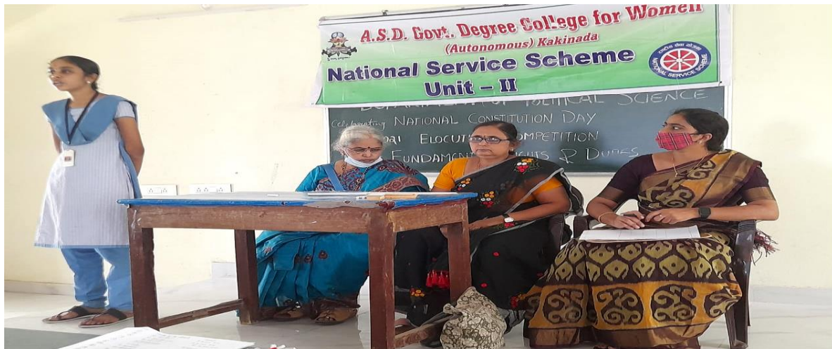
Action photographs of Elocution competition on the eve of National Constitution Day