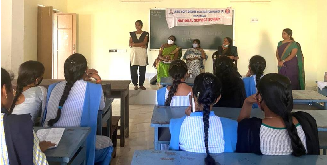
NSS UNIT-I and II Students Participating in Elocution and quiz competition conducted on 06/01/2022