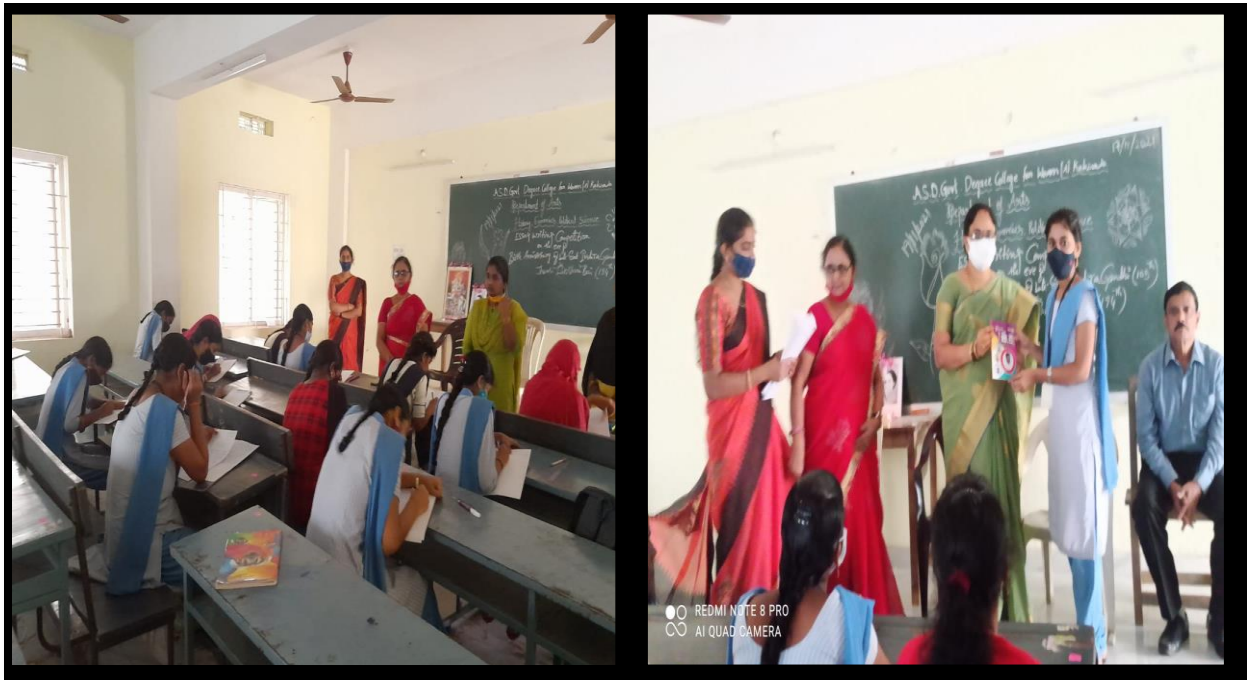
Action photographs Elocution competition conducted and Prizes being distributed