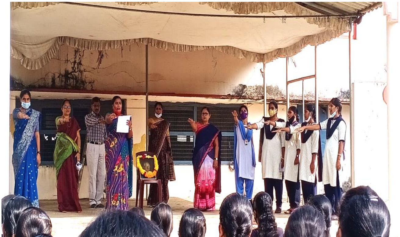
Action photographs of Preamble Pledge being taken On National Constitution Day