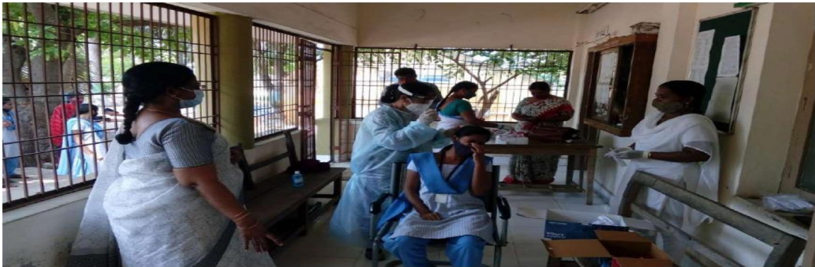
Medical Staff testing the students

With the instructions of CCE, Principal consulted the local medical authorities and made arrangements of Covid tests for College staff and students on 20 th April 2021.