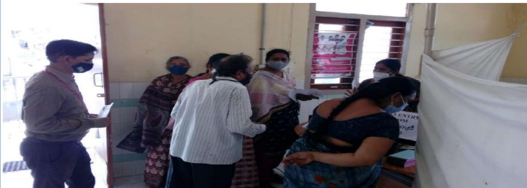
College Staff at the Vaccination Center

As per the instructions of CCE, the College Teaching and Non Teaching staff, above 45 years took initiation to have vaccinated and approached the Govt. medical staff at Covid Vaccination Center, Kakinada on 24 April 2021.