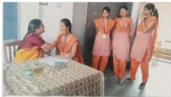
Plate 1: Observation of Iron deficiency Anaemia