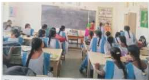
Plate 1: Demonstrating Assessment of Mid upper Arm Circumference