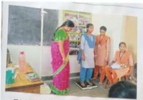
Plate 1: Demonstrating Assessment of Weight