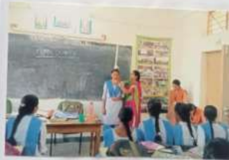
Plate 2: Demonstrating Assessment of Height