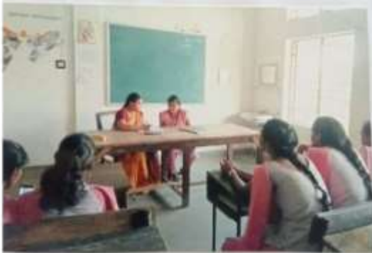
Plate 2: Recording Morbidity Pattern