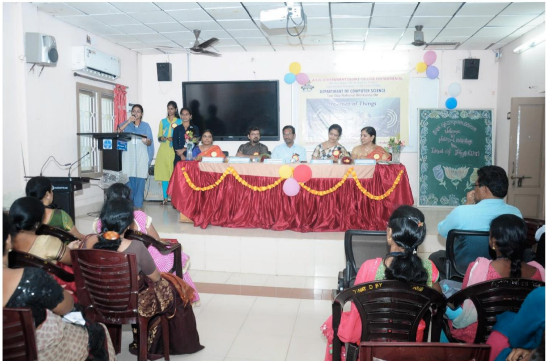
PARTICIPANTS FEEDBACK ON THE WORKSHOP