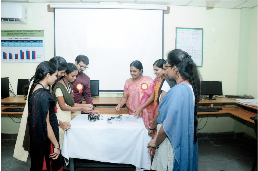
STUDENTS WORKING WITH IOT SENSORS