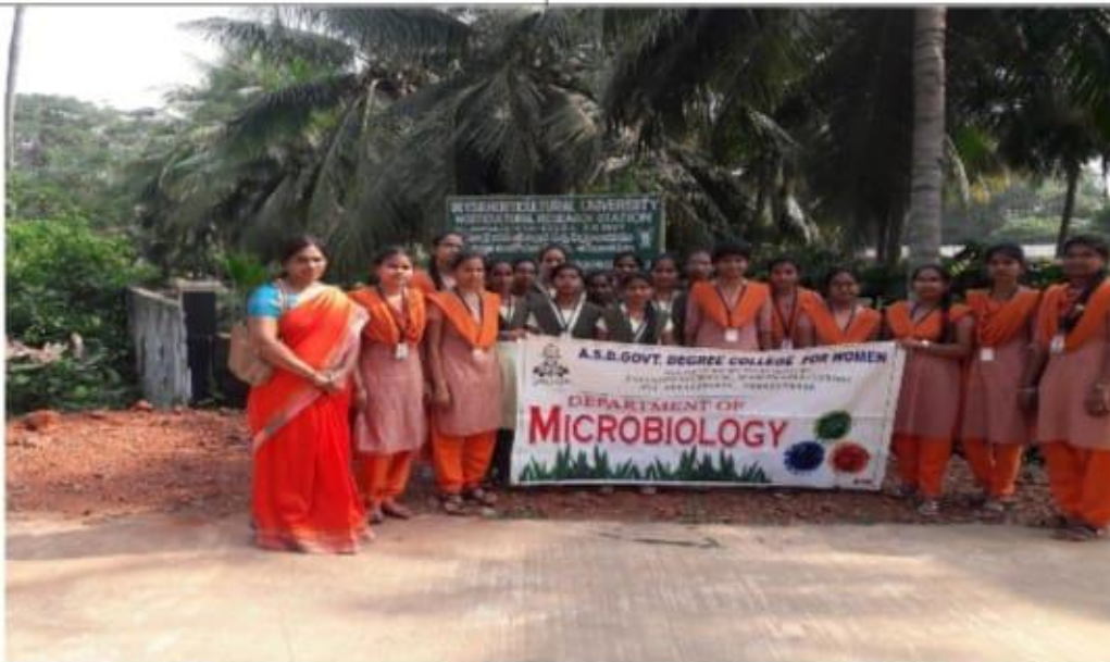
II and III BSc Students of Microbiology Visited Horticultural Research Station, Dr. Y. S.R Horticultural University, Ambajipeta, East Godavari District on November 24 2018