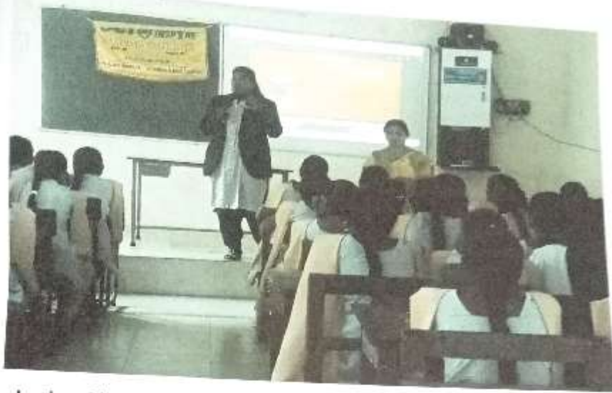
Junior Chamber International, Kakinada Created Awareness on Personal Hygiene on February 4 th 2019 for I BSc