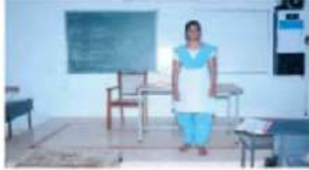
Just A Minute (JAM)