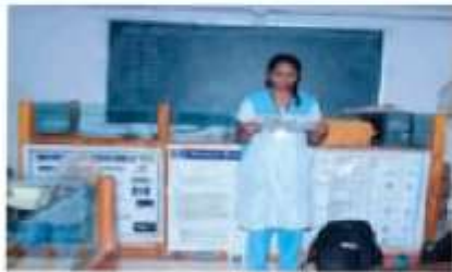
News Paper Reading