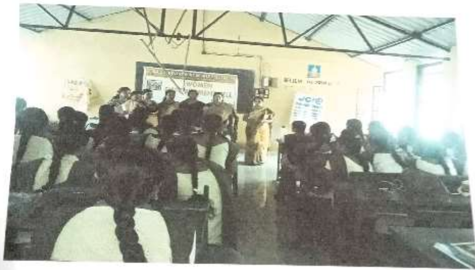
Junior Chamber International, Kakinada Created Awareness on Personal Hygiene on February 6 th 2019 for III BSc