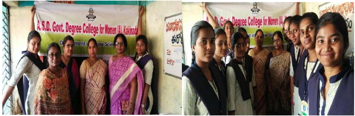
The department of Home Science visited the old age home on 10<sup>th</sup> March 2023 as a part of the extension activity distributed Aluminum cooking vessels to the old age home.