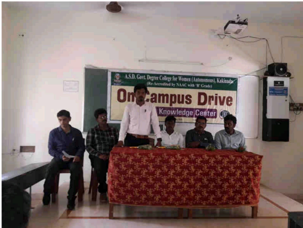
Explanation of Alcance Company details by HR