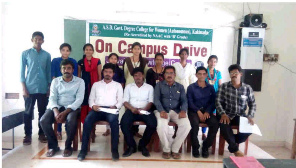
Selected students with HR's & JKC Team