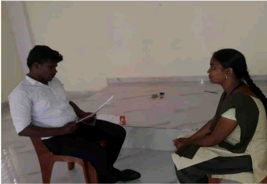
Student facing personal Interview