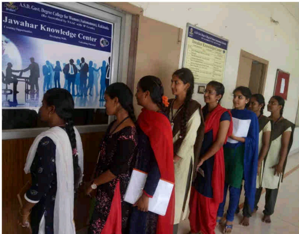
Students waiting for their turn in Campus drive