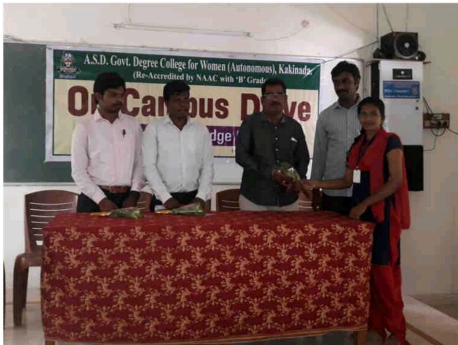
Campus Selection Inauguration