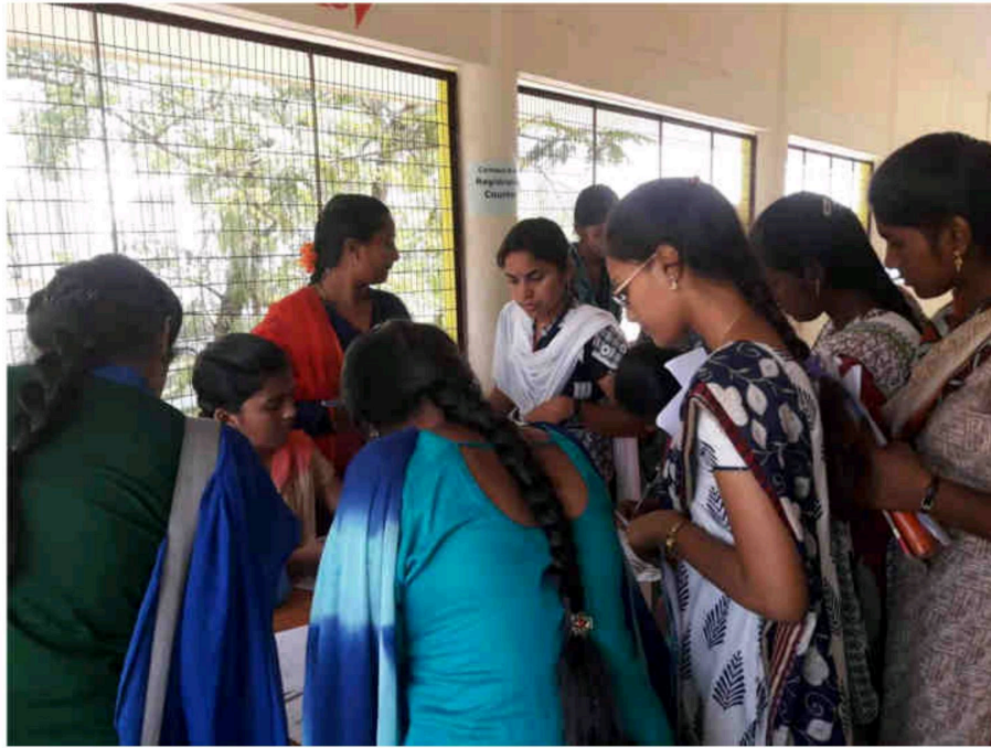
Students Registering for Campus drive