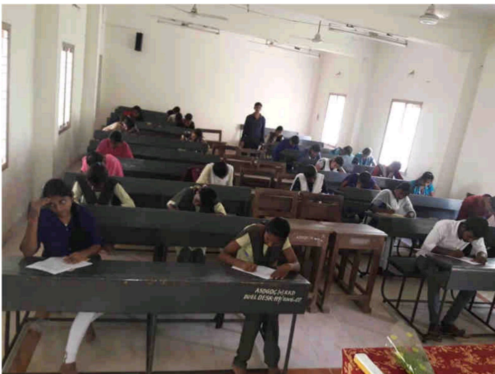
Students Writing Test for Alcance campus selection