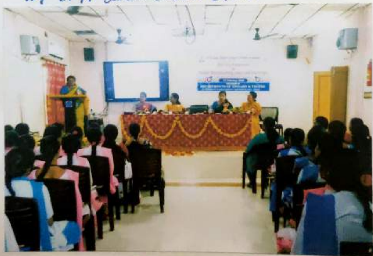
Discussion Session on "Gender Issues".