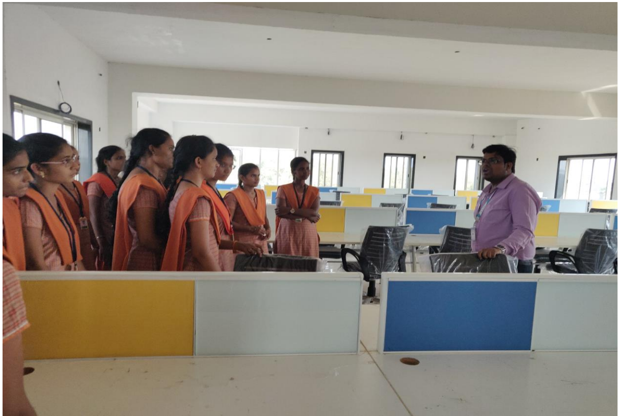
Students talking to HR at Krify Software Tech. Pvt. Ltd.,