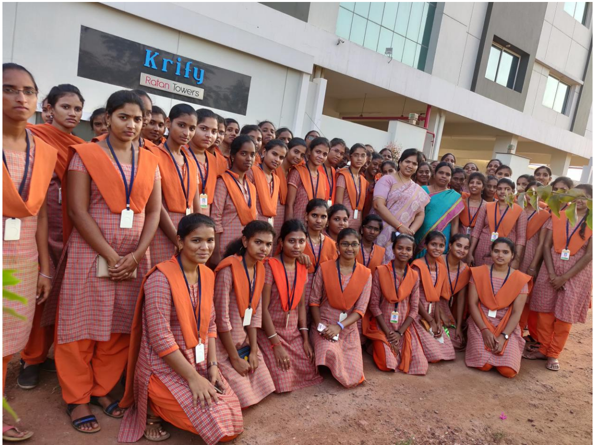
Students at Krify Software Tech. Pvt. Ltd.,