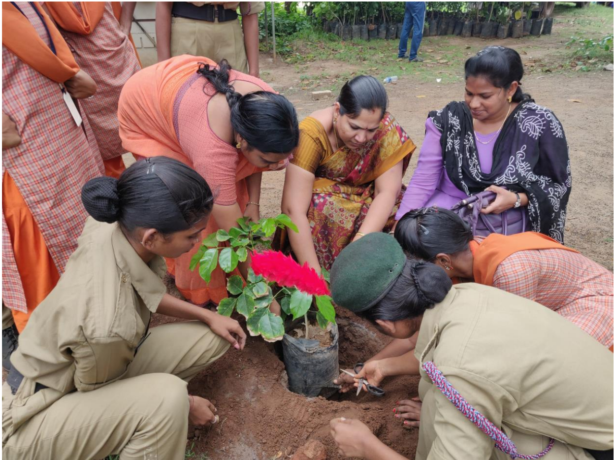
Faculty & Students participating in Vanam-Manam