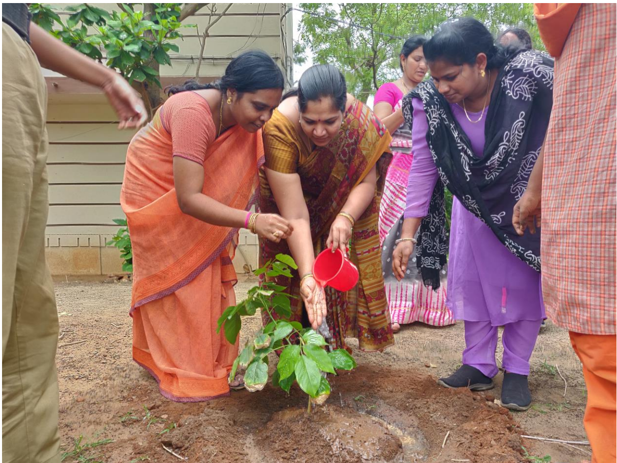
Faculty in Vanam-Manam