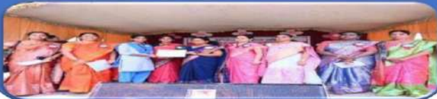
STUDENTS RECEIVING CERTIFICATES AND PRIZES