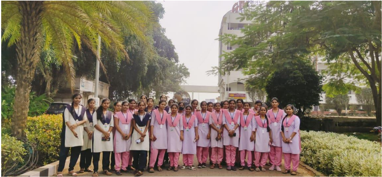
VISIT TO GIET COLLEGE IN RAJAHMAHENDRAVARAM