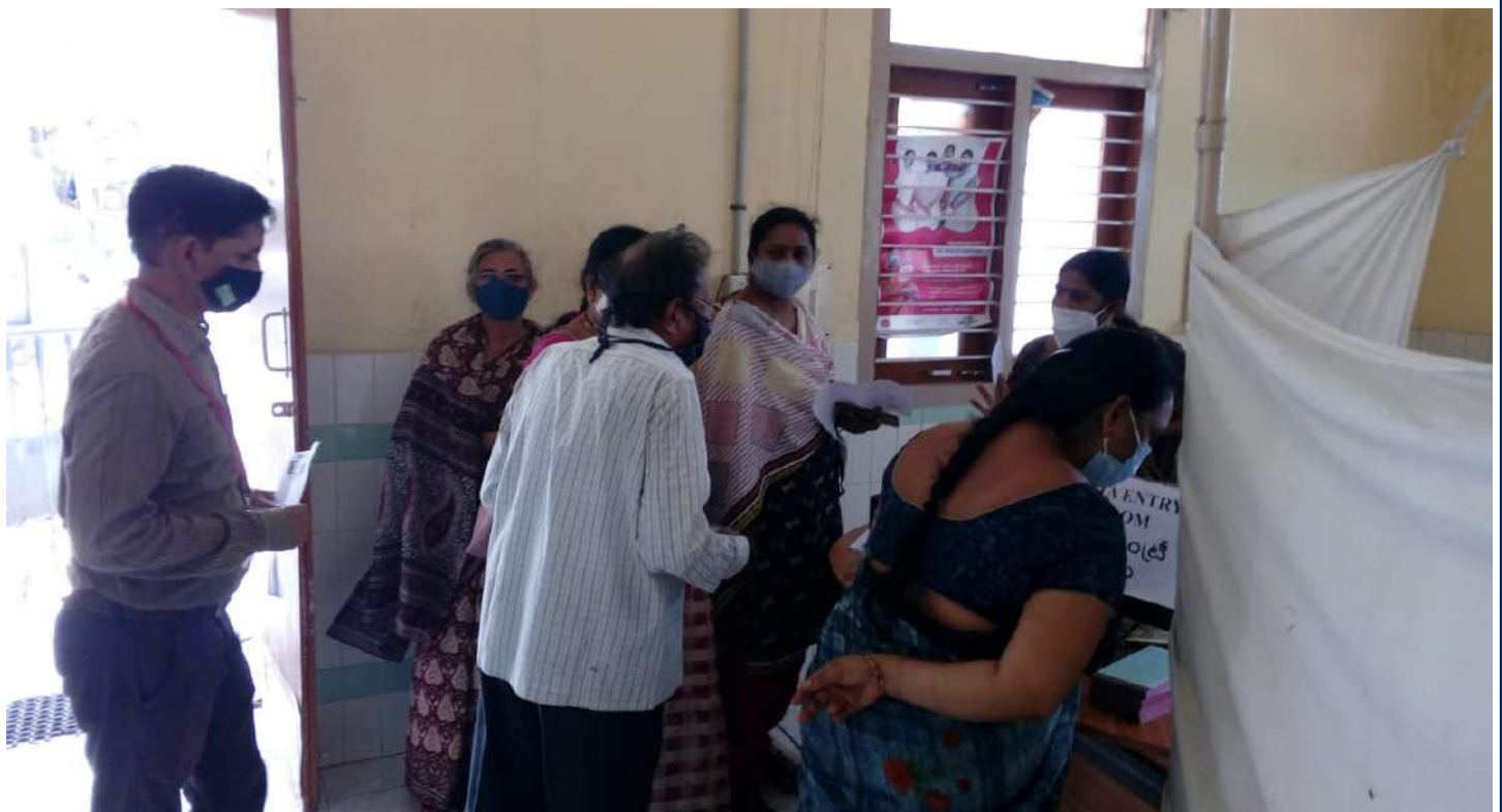
College Staff at the Vaccination Center

As per the instructions of CCE, the College Teaching and Non Teaching staff, above 45 years took initiation to have vaccinated and approached the Govt. medical staff at Covid Vaccination Center, Kakinada on 24 April 2021.