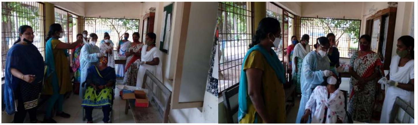
Staff taking Covid test