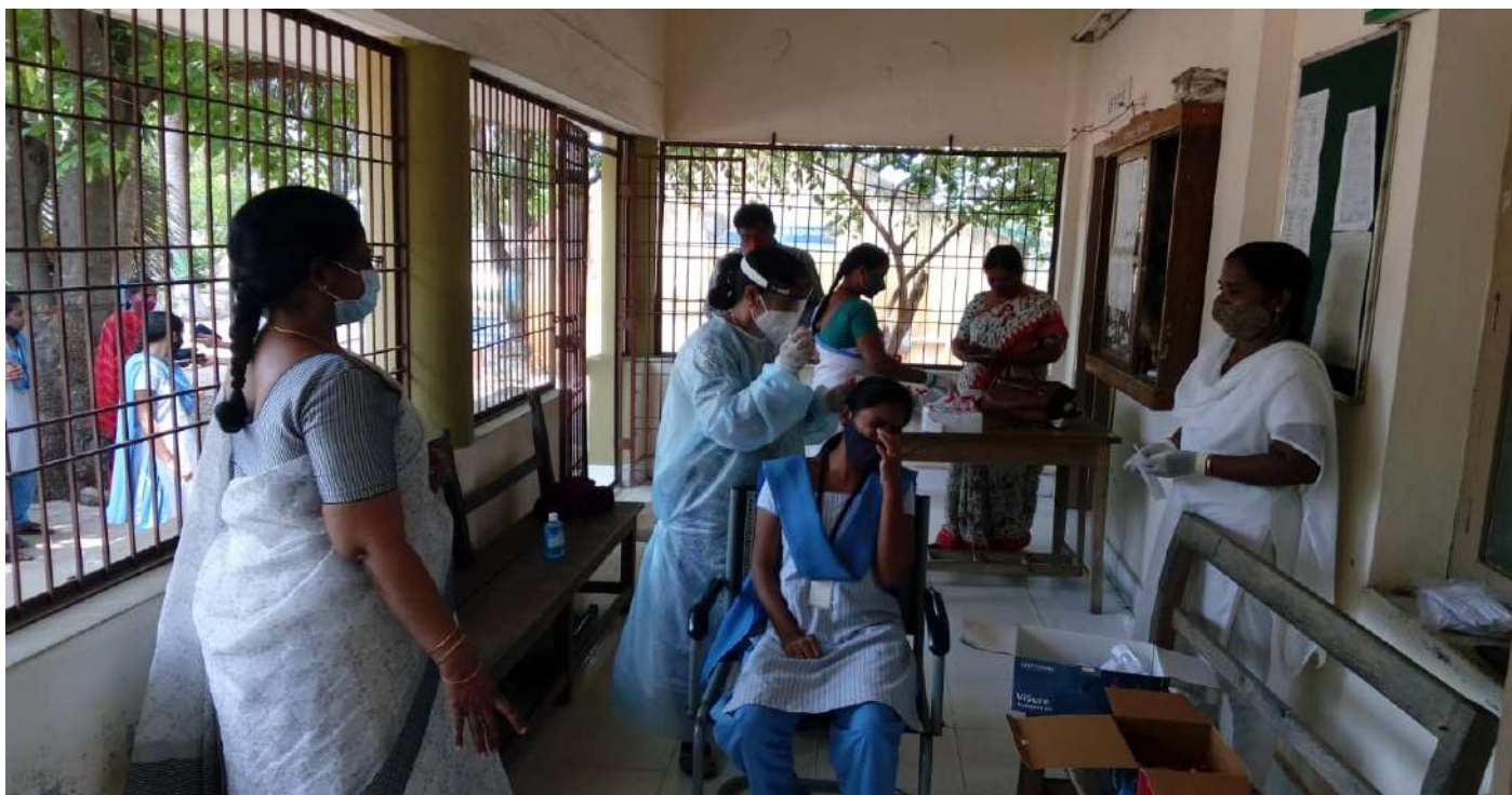
Medical Staff testing the students

With the instructions of CCE, Principal consulted the local medical authorities and made arrangements of Covid tests for College staff and students on 20 th April 2021.