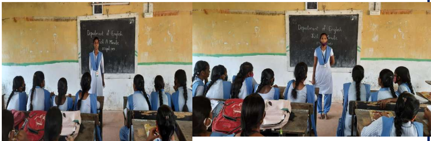
Students Participation in JAM Session