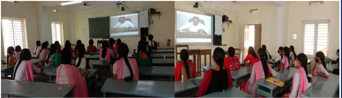
Students watching the CM Video Conference on the release of “Jagananna Vidya Dheevana”