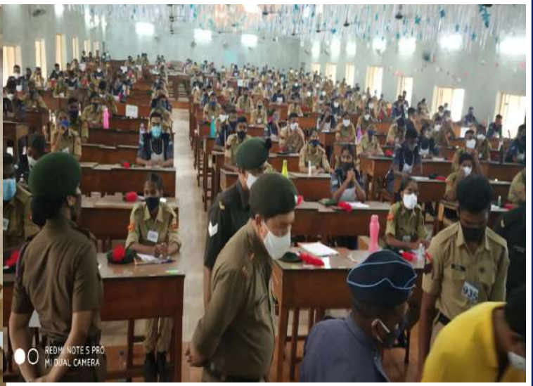
NCC 'B'-Certificate Theory Exam