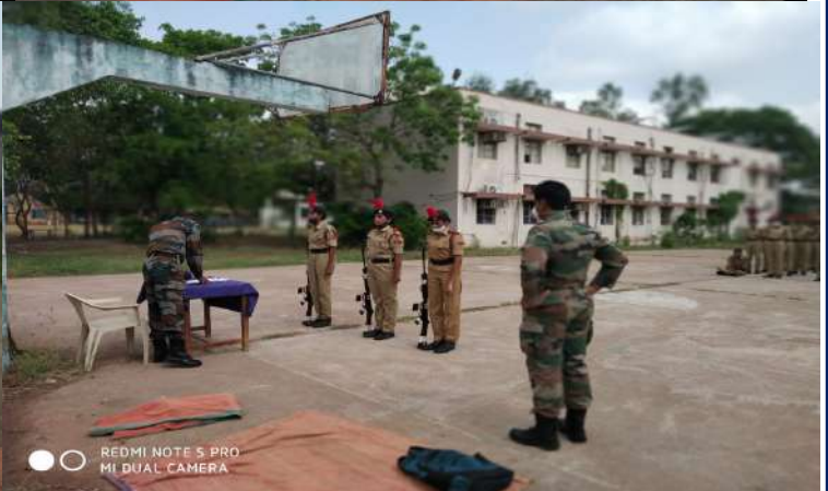
NCC 'C'-Certificate Practical Exam