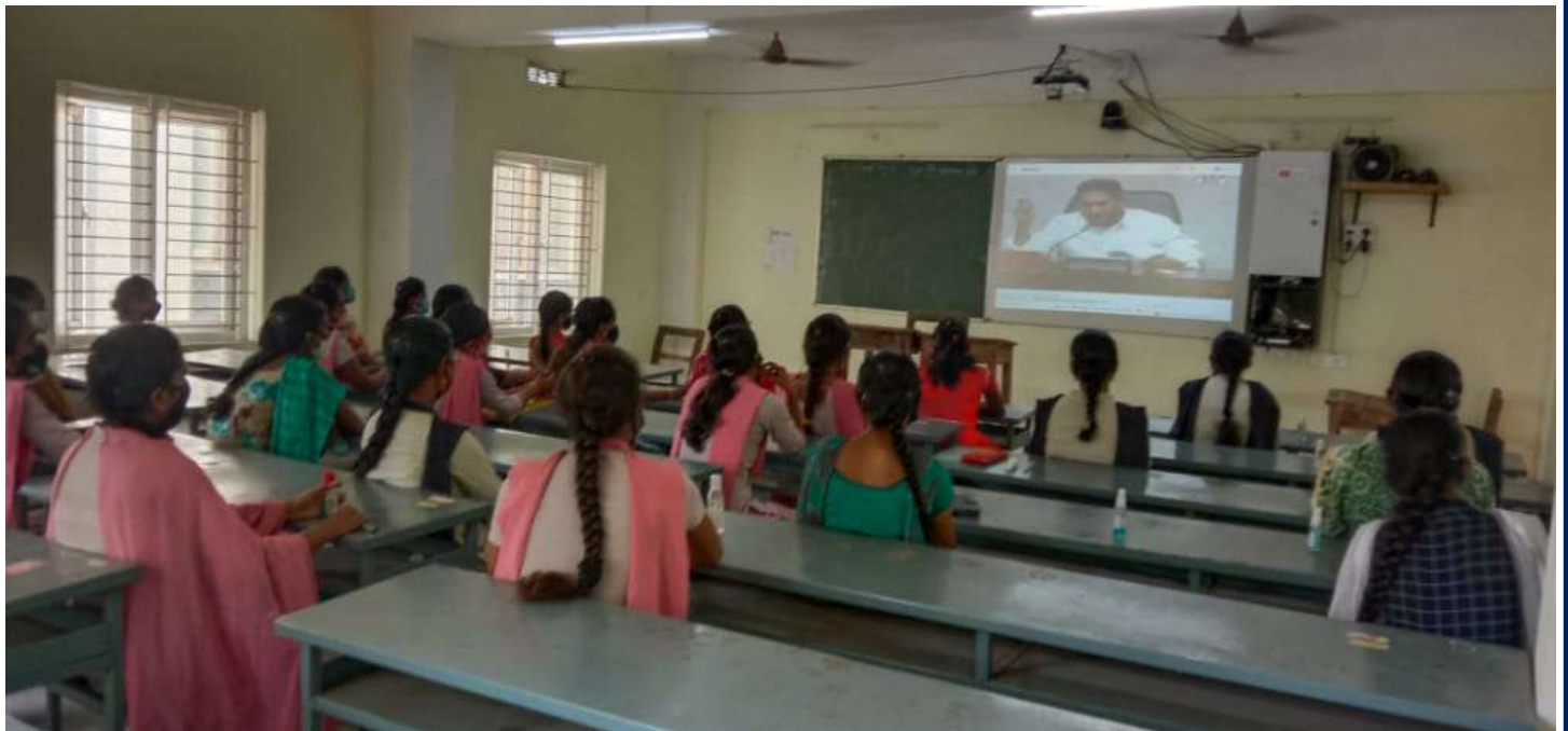
Students watching the release of Jagananna Vidya Devena

It's a great privilege for the students for being supported financially under the flagship of "Jagananna Vidya Devena" for pursuing their higher education. The students of the college attended the CM Video Conference on 19 th April 2021 in the Virtual Classroom.