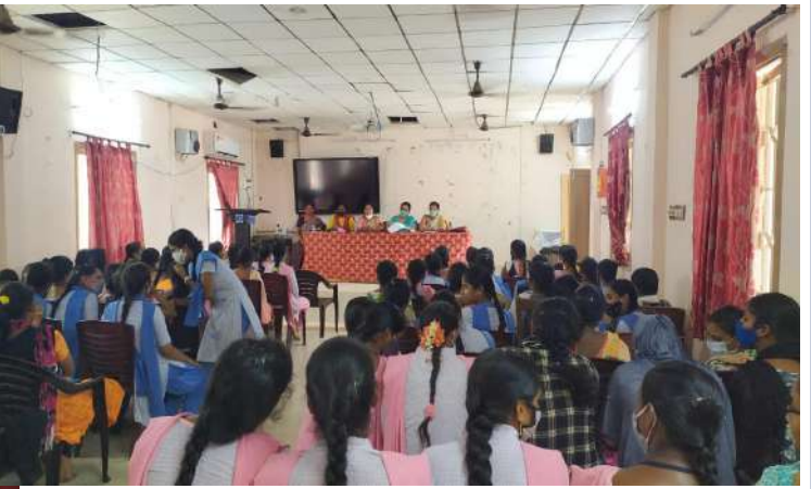
Students Union Election