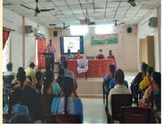
Parakram Diwas Celebrations