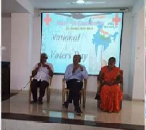
Awareness Programme at RCS