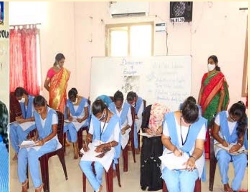
English Essay Writing