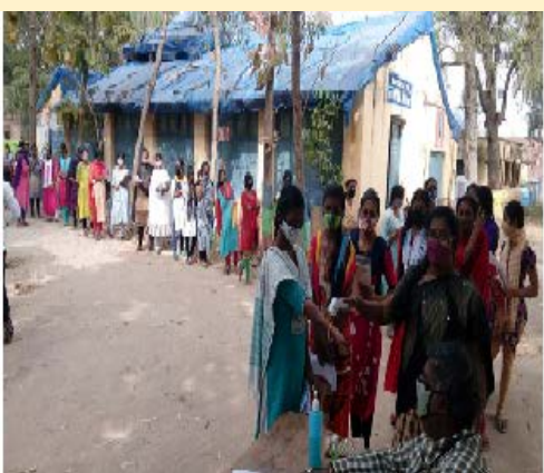
Thermal Scanning & Sanitization