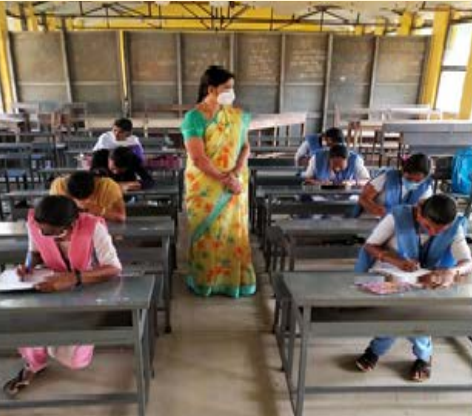
Essay Writing Competition