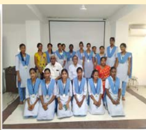
ASD Volunteers at RCS