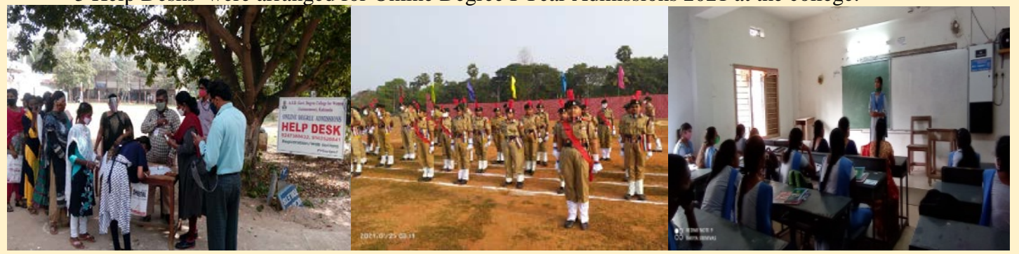
Help Desk for the web options

• 5 Help Desks were arranged for Online Degree I Year Admissions 2021 at the college.