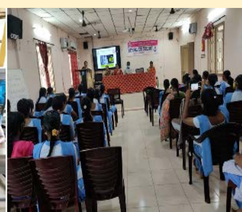
National Girl Child Day-Guest Lecture