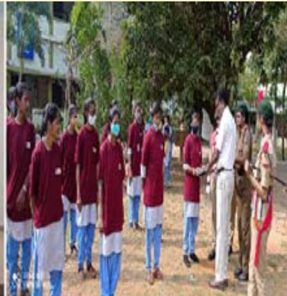
Distribution of T-Shirts