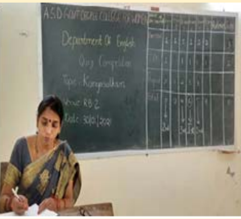
Quiz Feedback to Students