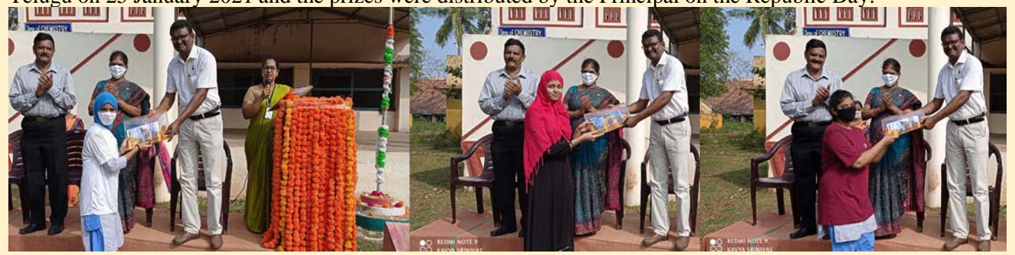
Prize Distribution by the Principal

On the occasion of Republic Day, literary competitions were conducted by the Departments of English and Telugu on 25 January 2021 and the prizes were distributed by the Principal on the Republic Day.