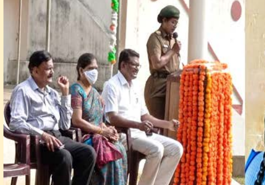
NCC Officer announcing parade