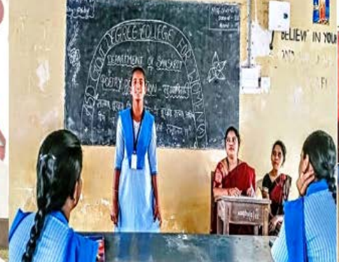
Sanskrit Poetry Recitation