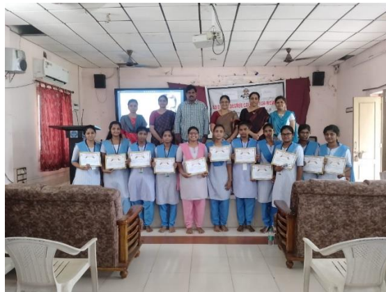
Students with their participation certificates