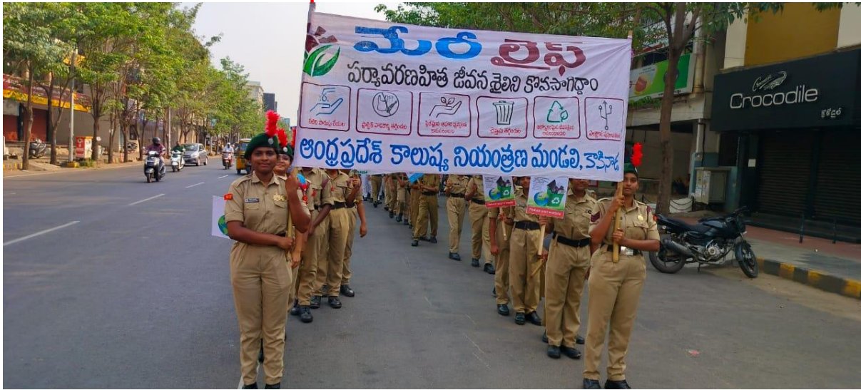
Rally on World Environment Day – 05/06/2023