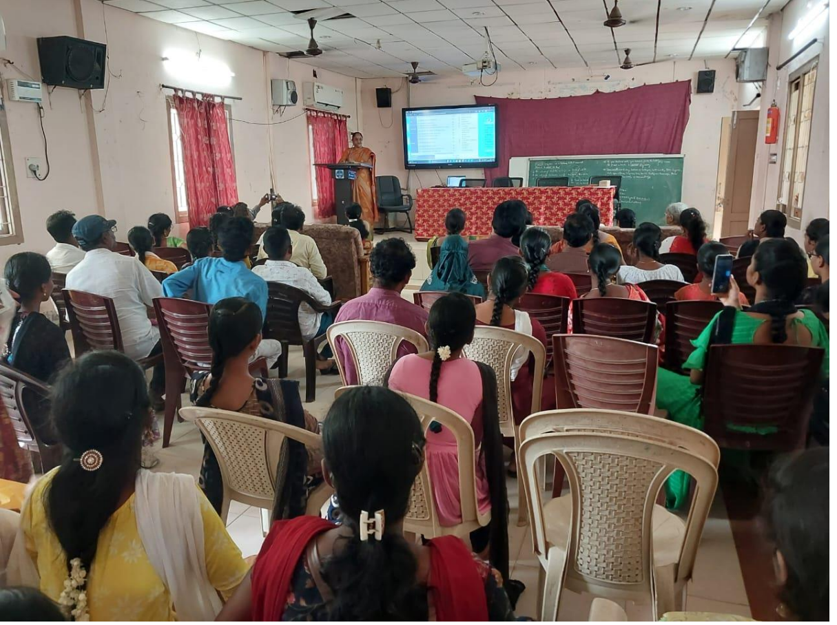
Admissions Open Day on 19/06/2023