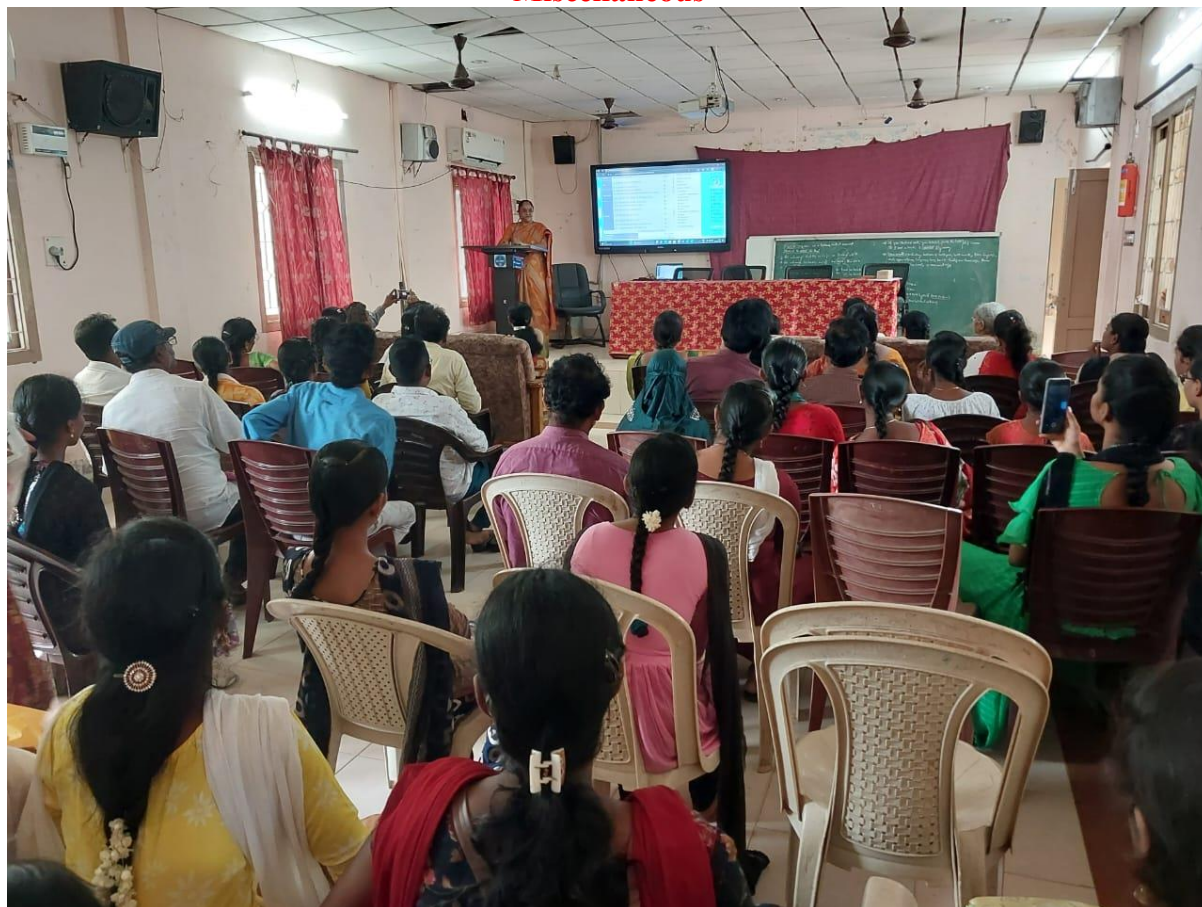
Awareness Meeting on Admissions 2023 - 24: Major & Minor Programmes on 15/06/2023