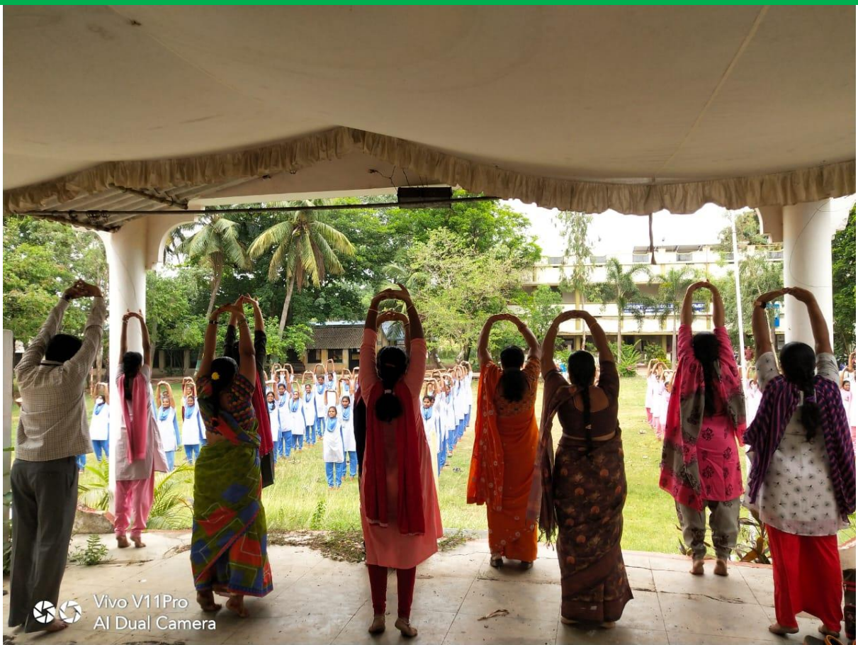
Yoga Week – Assembly Hours