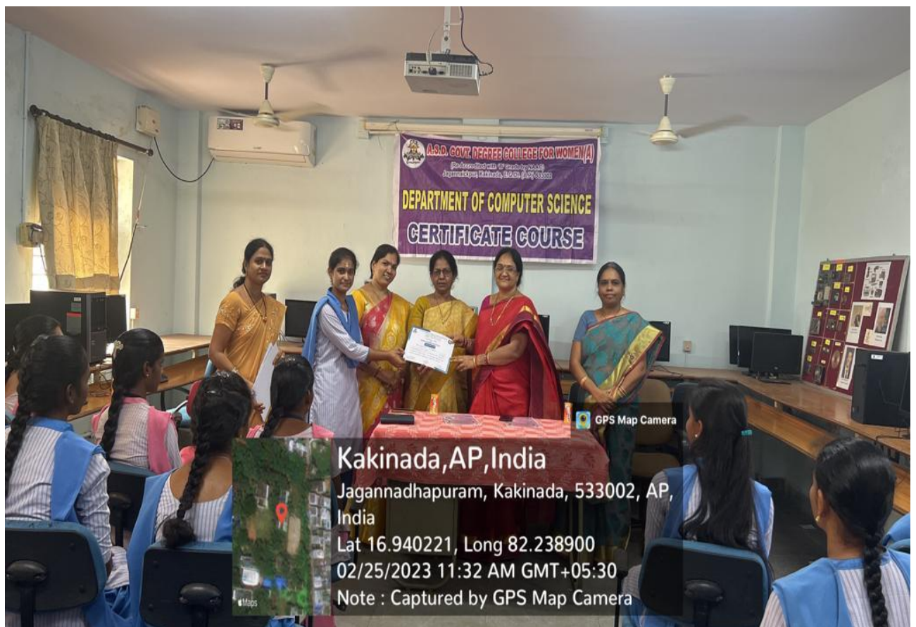
Distribution of Certificates