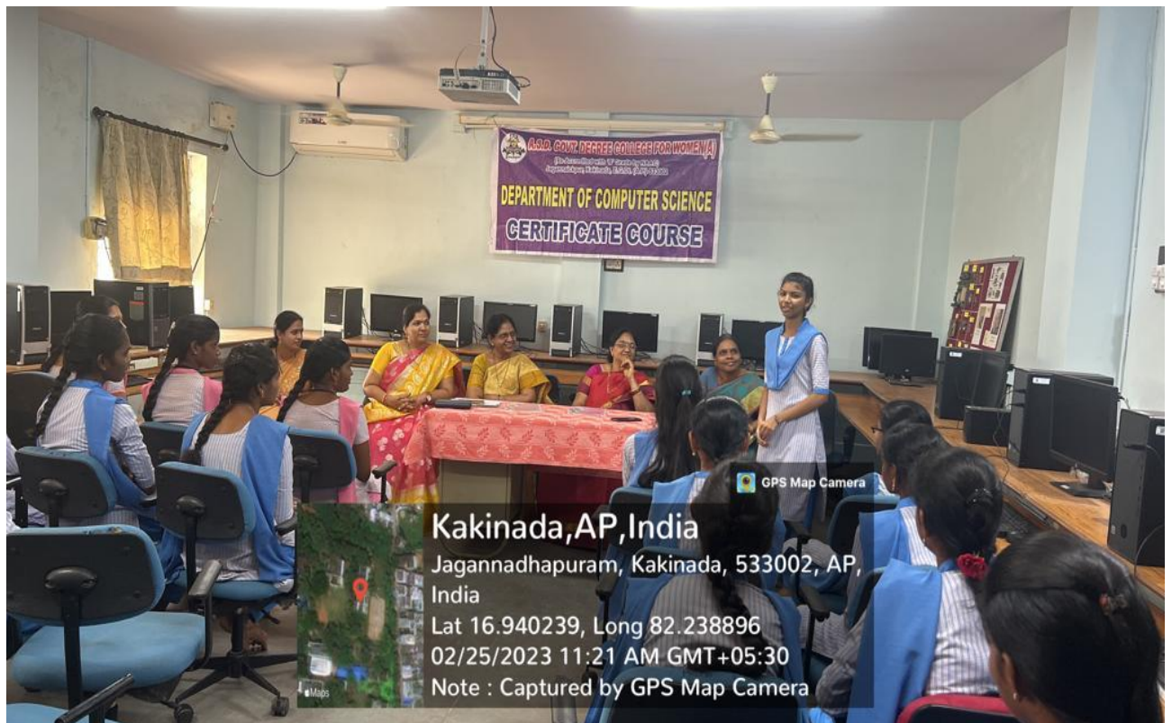
Collecting Feedback by the participant of the Certificate Course