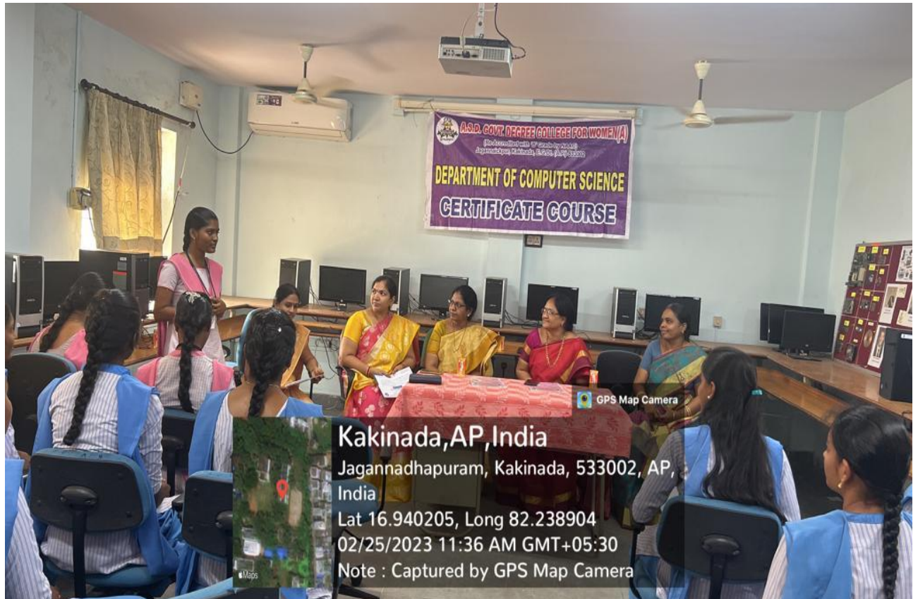
Collecting Feedback by the participant of the Certificate Course