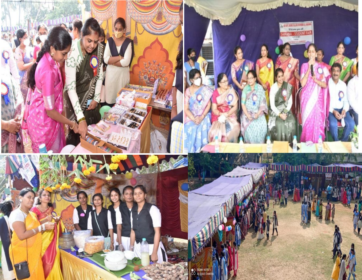
SAMANA - A COMMERCE STUDENT FAIR – 17/12/2021