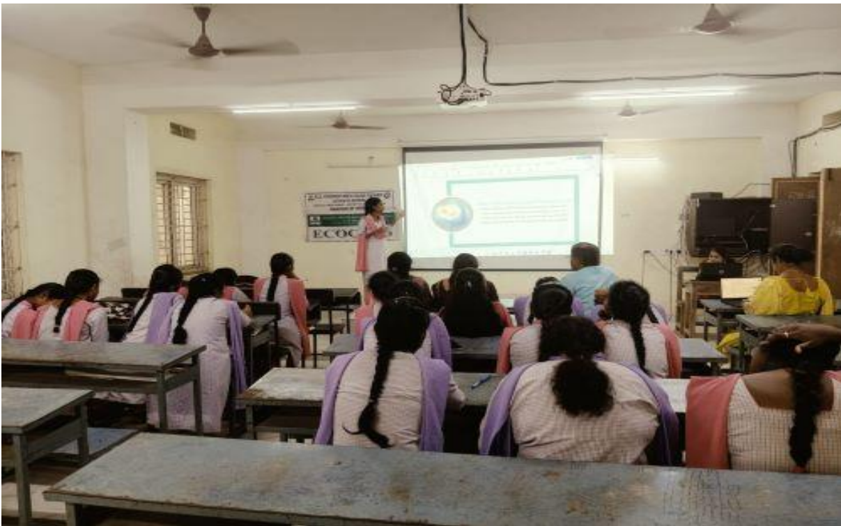
Power Point Presentation by Students