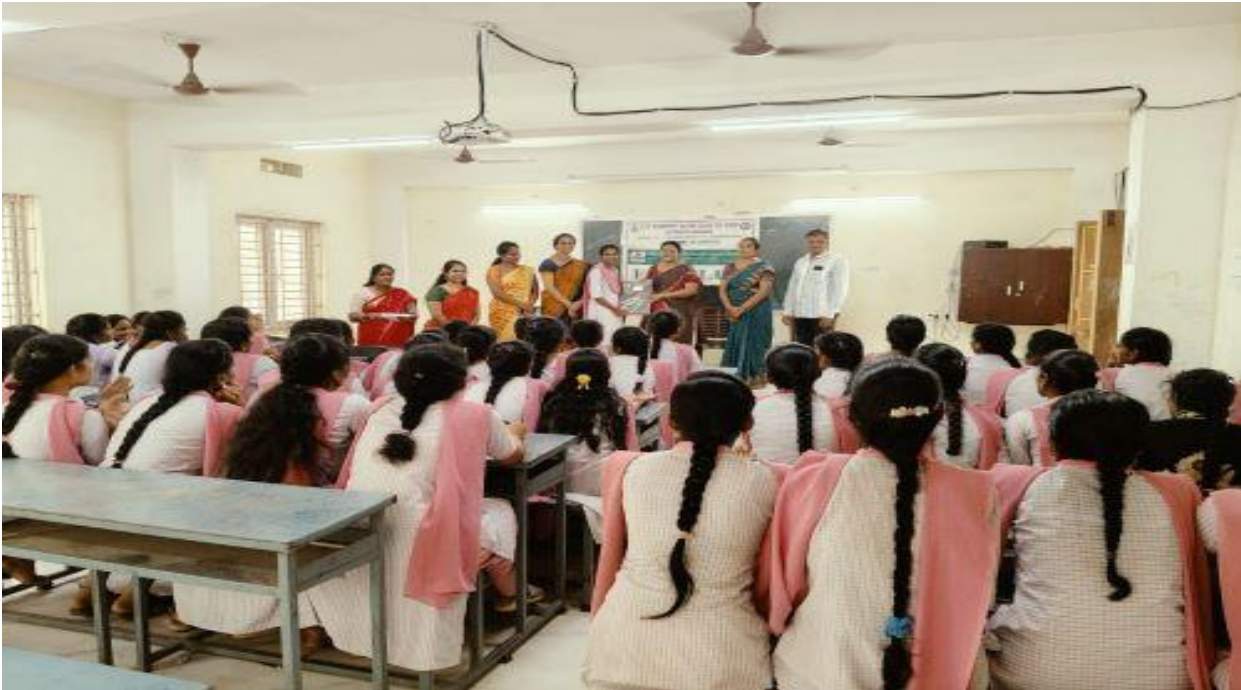
Prize distribution to the Winners