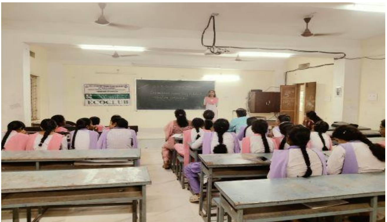
Oral Presentation by Students