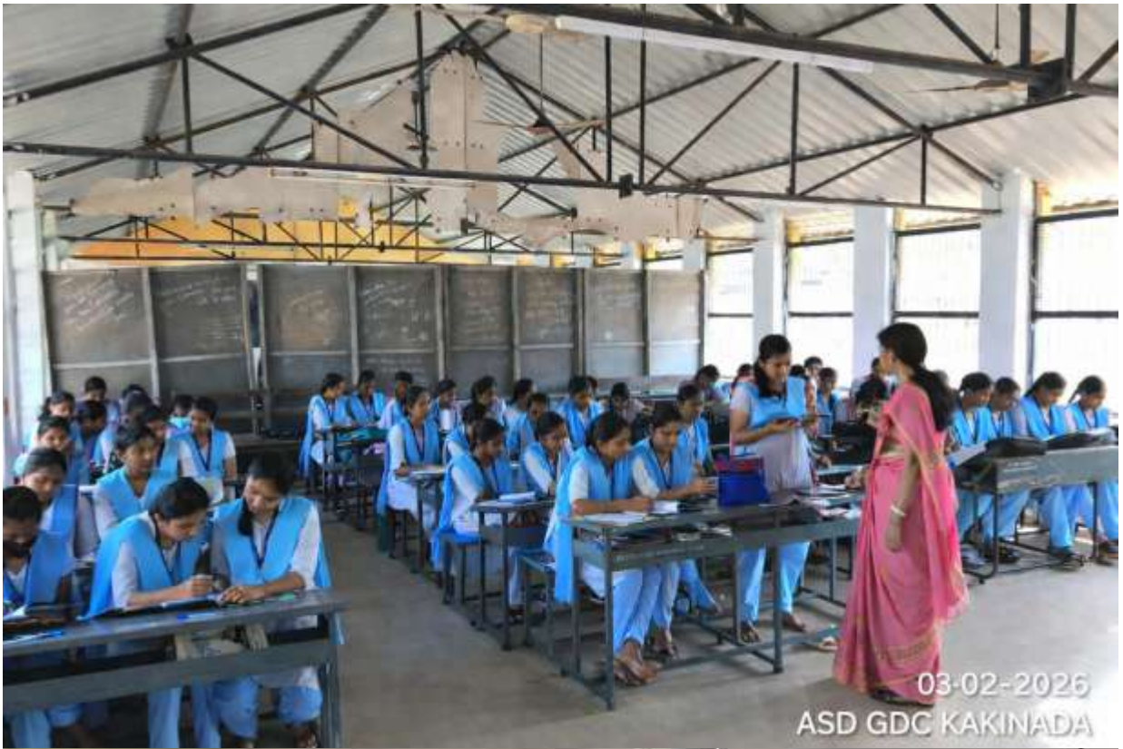
03-02-2026 ASD GDC KAKINADA