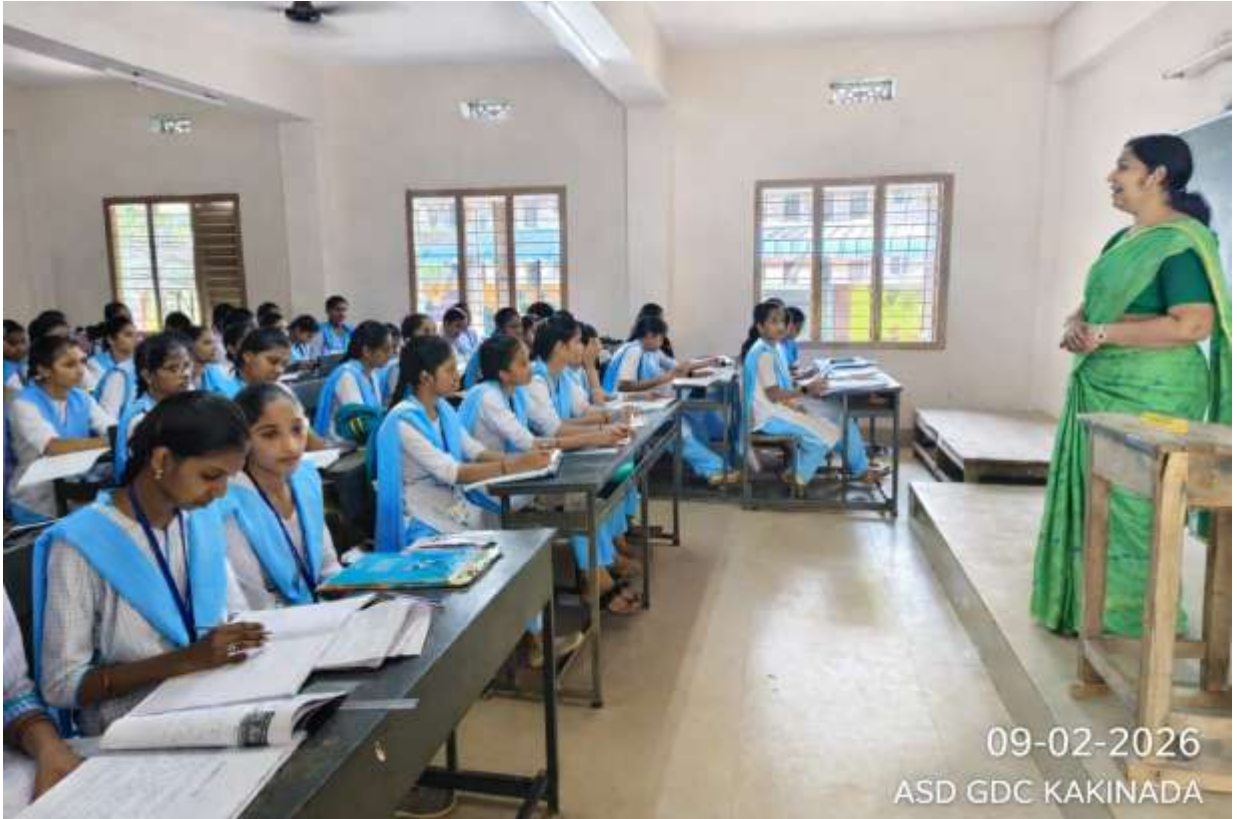
09-02-2026 ASD GDC KAKINADA