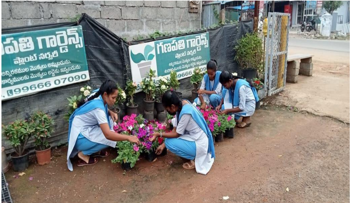
Students learning Propagation Techniques