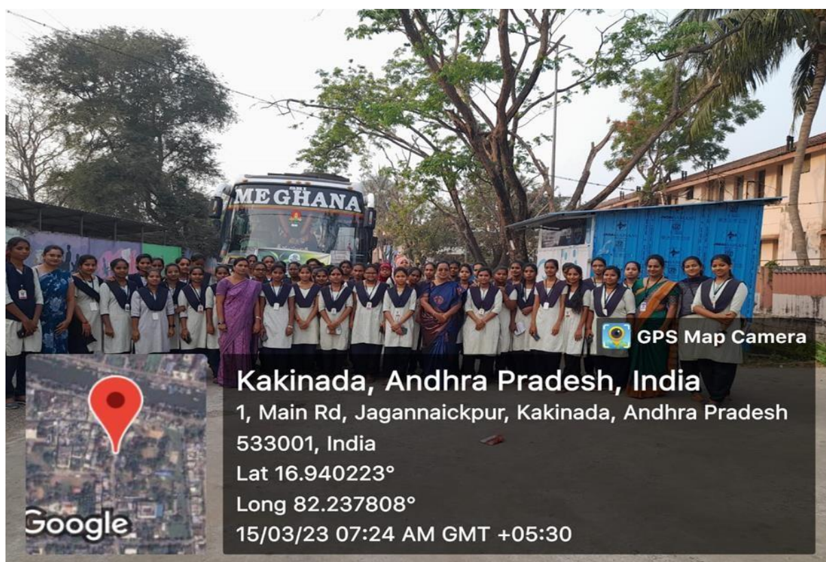
Students and Faculty near College gate before starting to Field Trip