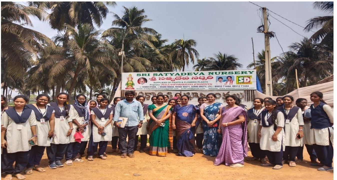
Students and Faculty near Satya Deva Nursery