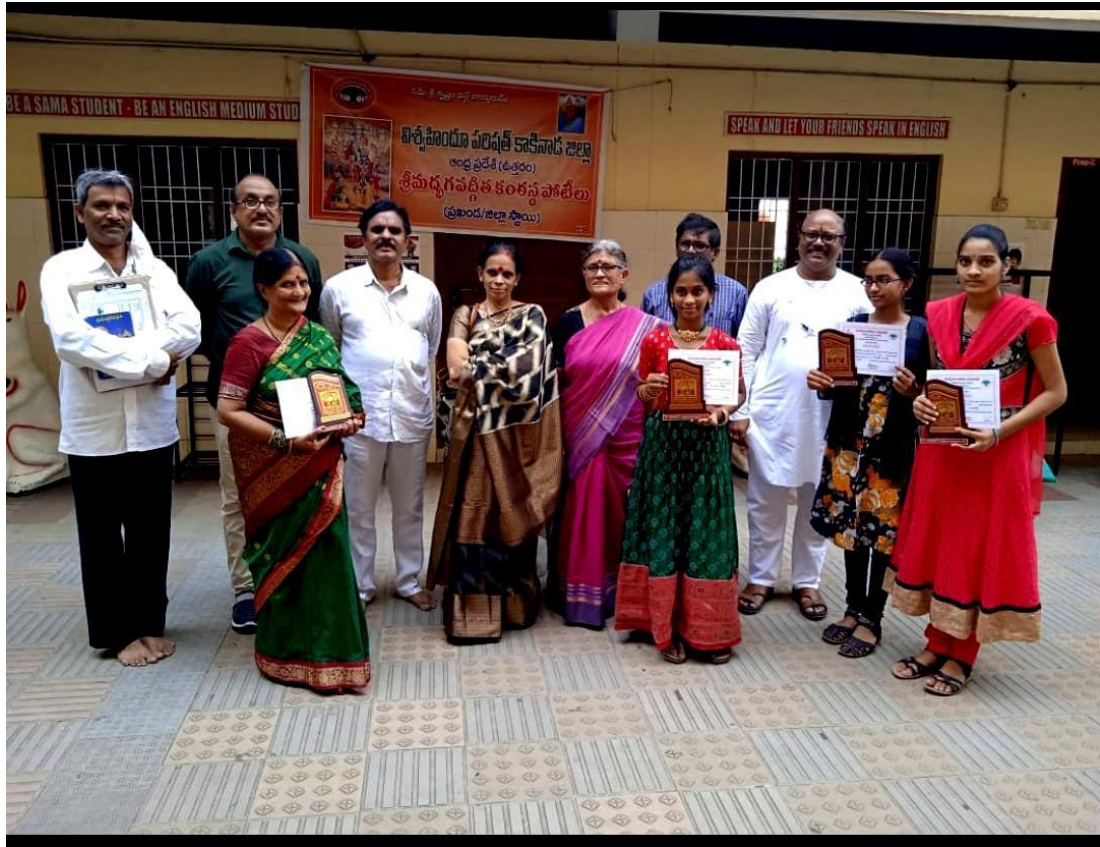
A.bangaru III B.A(T.H.P) got 3 rd prize