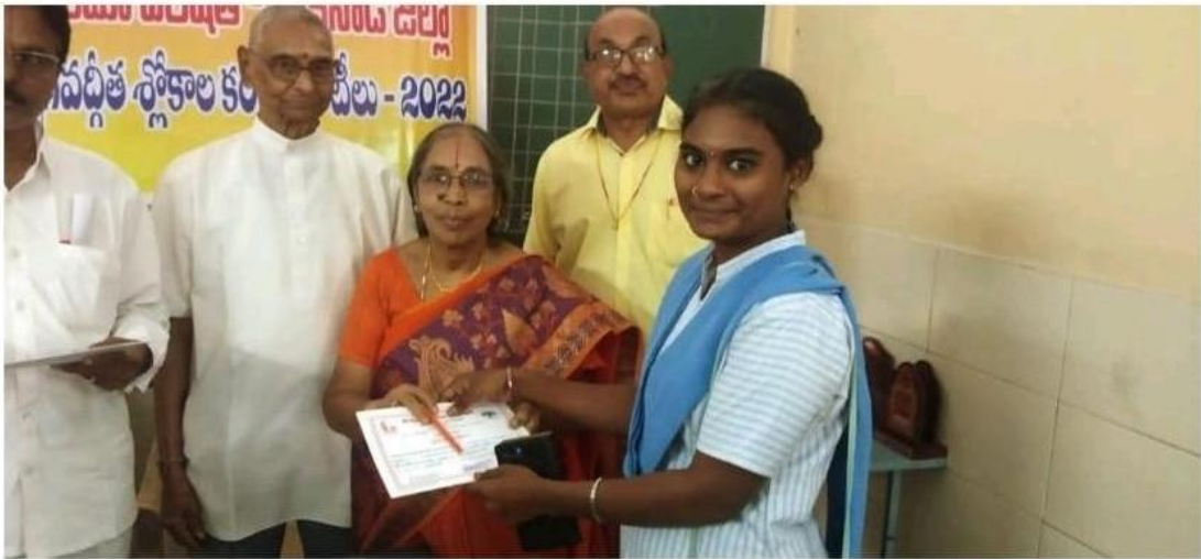
A.AKSHAYA II MPCs