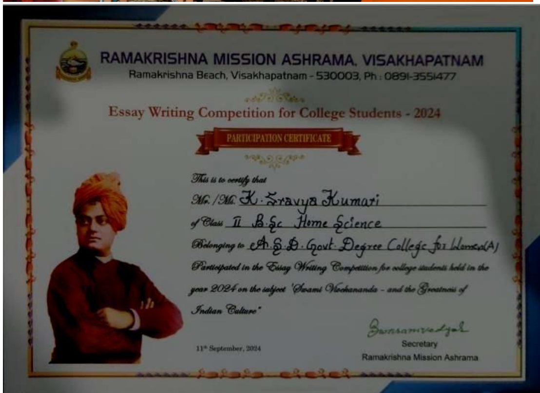
Students Received certificates from Ramakrishna Mission Ashrama, Vishakapatnam on participating competition