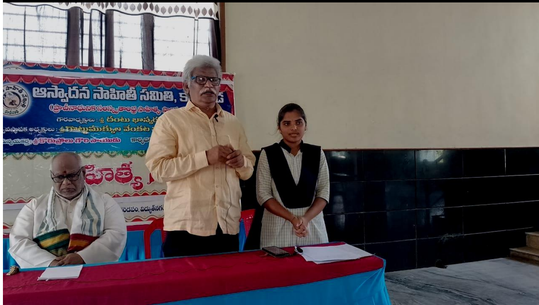
S.Yamini-III CBZ delivered Literary Talks on different topics at Aswadana Sahiti Samiti from March 2022 to 30th April 2022.