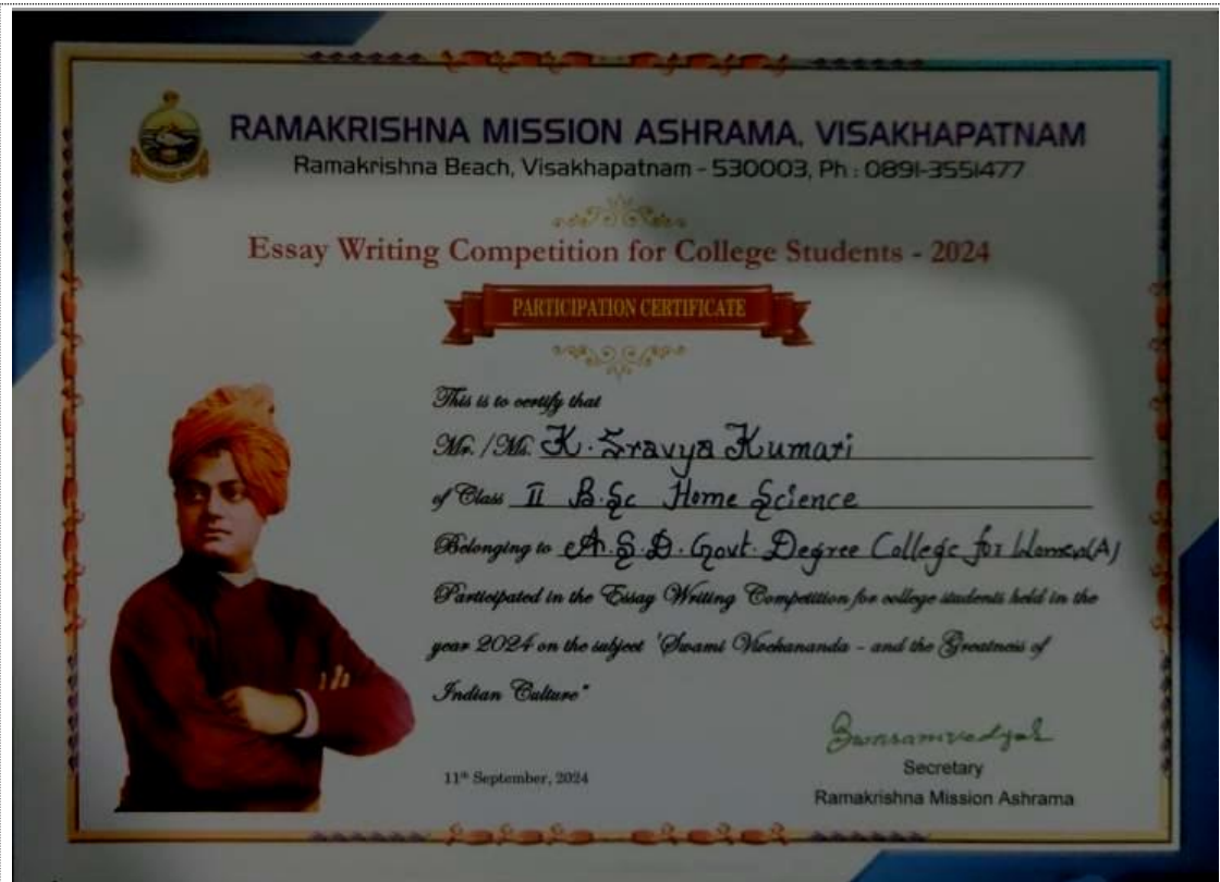
Students Received certificates from Ramakrishna Mission Ashrama, Vishakapatnam on participating in Essay Writing (English) competition