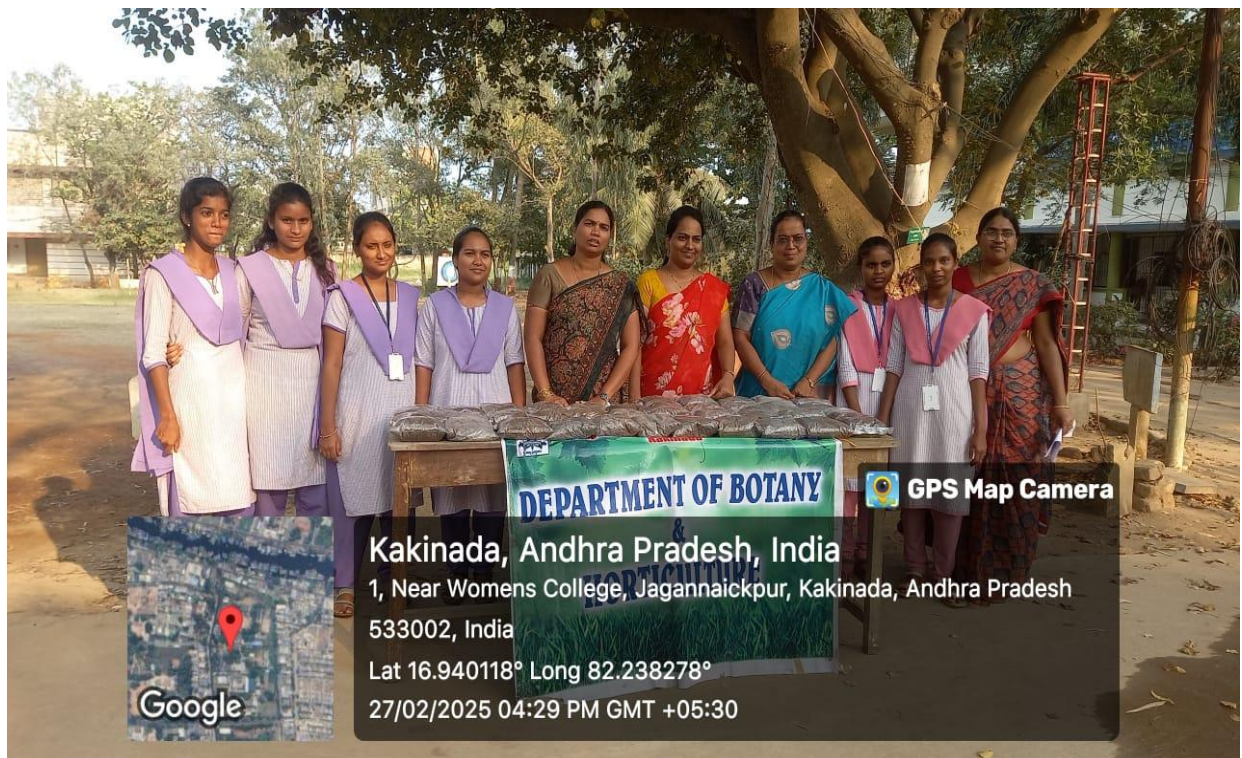
Sale of Farmyard manure prepared by Faculty & students of the Department