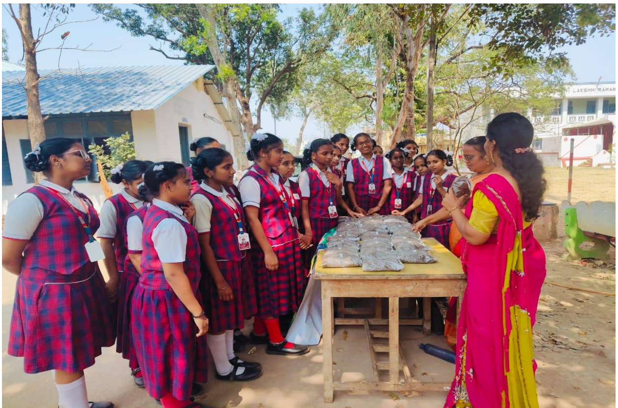
Faculty of the Department explaining about the preparation of Farmyard manure to the students of Aryan public School , Kakinada