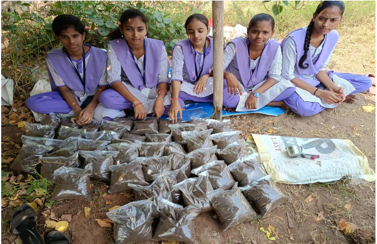
Compost Packets prepared for Sale