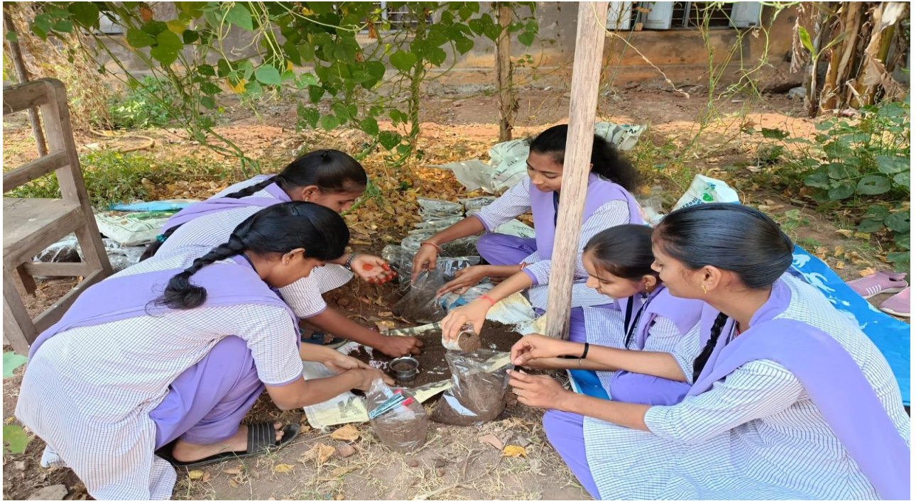
Packing of Compost by II Botany Honours Students