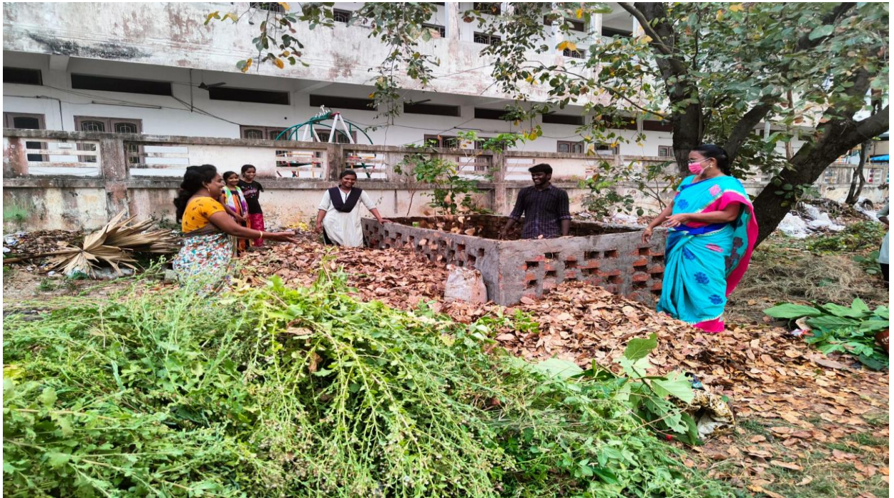
Students participating in the Preparation of Farmyard manure