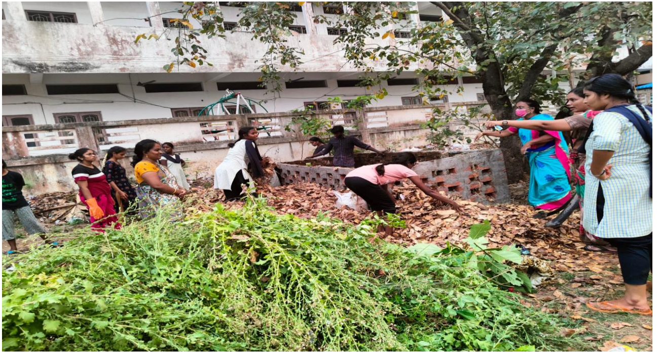
Preparation of Farmyard manure in NADEP Compost pit by faculty and Students of the Department