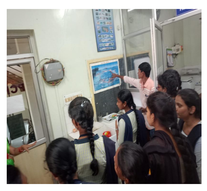
Observing prawn life cycle at PCR lab