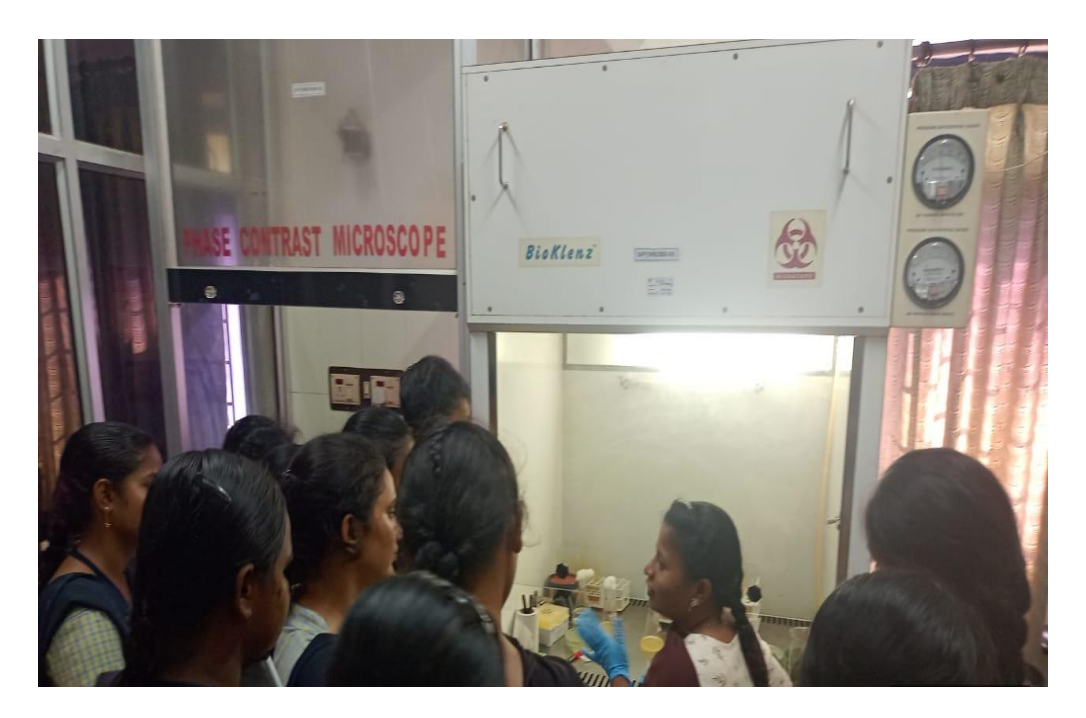
Observation of Pathogen diagnosis in aquatic animals at Microbiology lab, SIFT