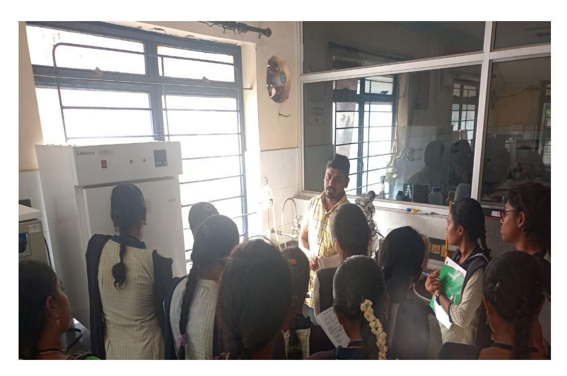
Observation of Nutritional Composition of Feed in Feed Analysis lab, SIFT