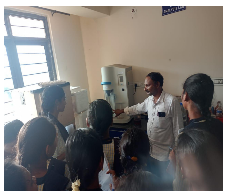
Observation of soil parameters testing in Soil analysis lab. SIFT