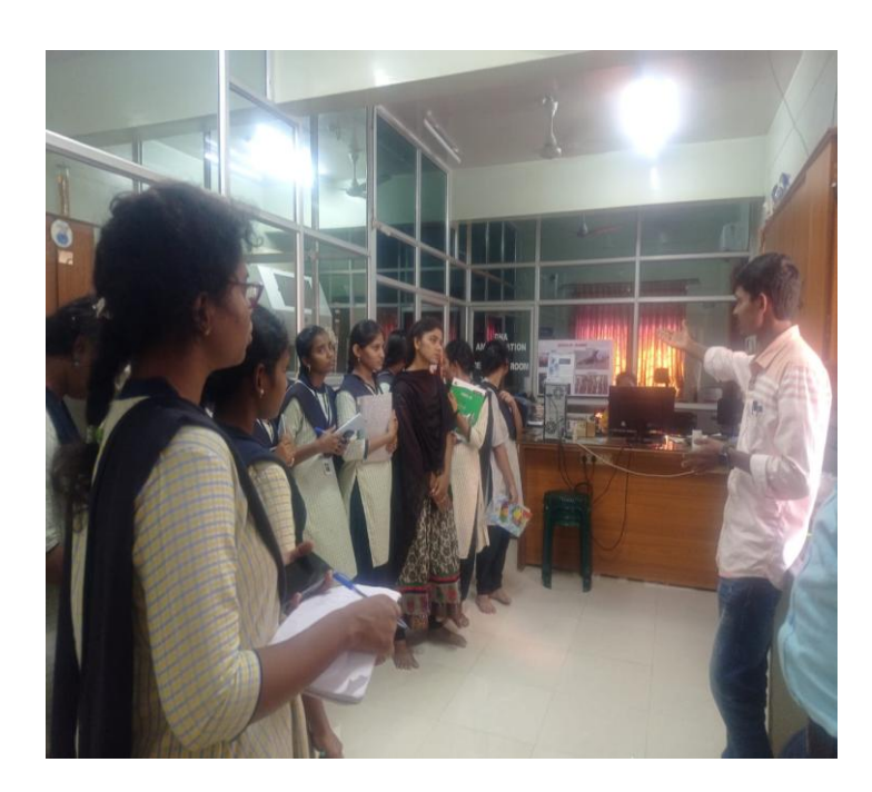
seed analysis through PCR lab