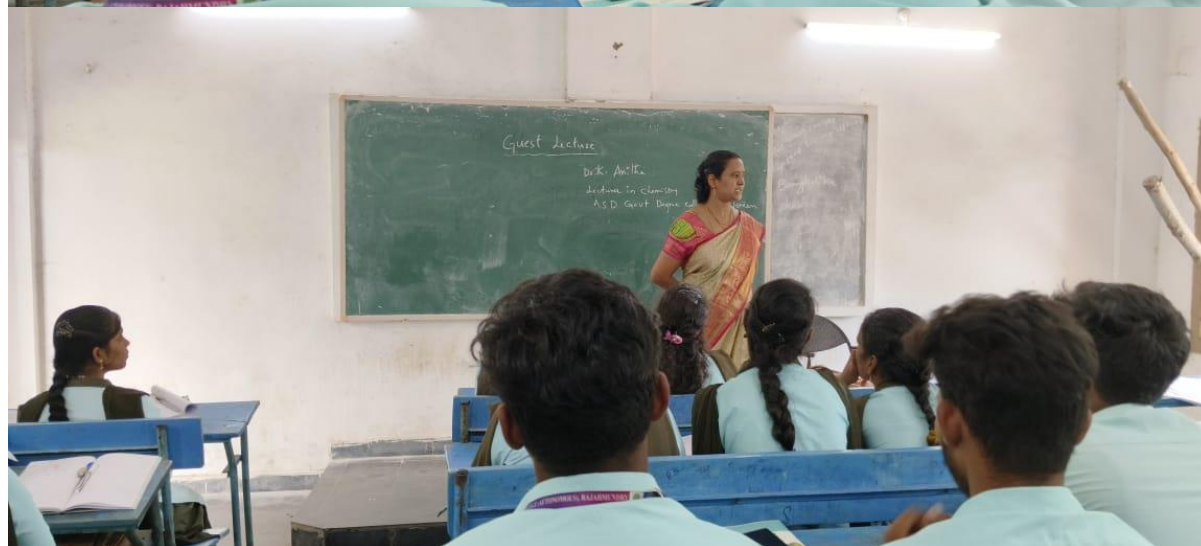
Guest lecture on “Structural theory in Organic Chemistry”