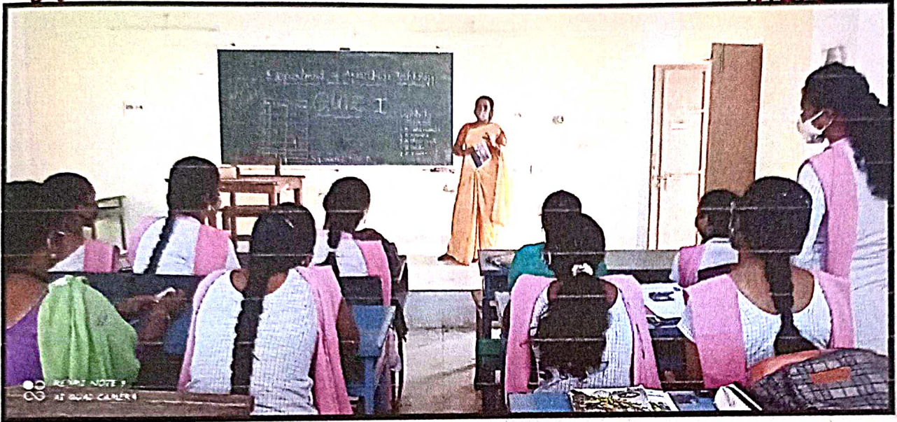
Final years students in Quiz Competition