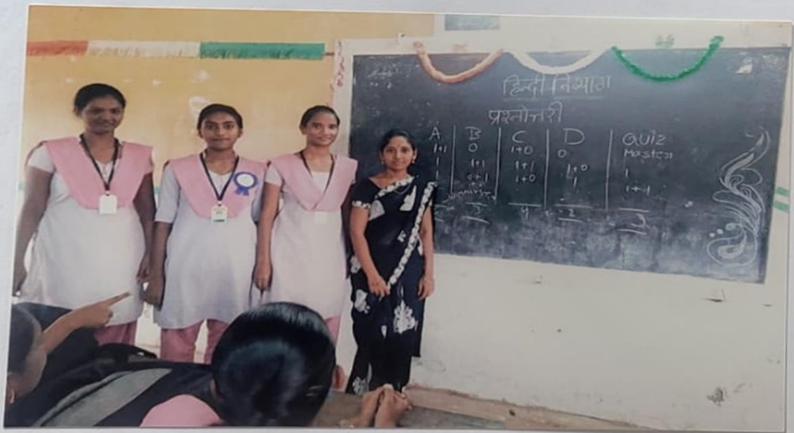
Winner Team - A