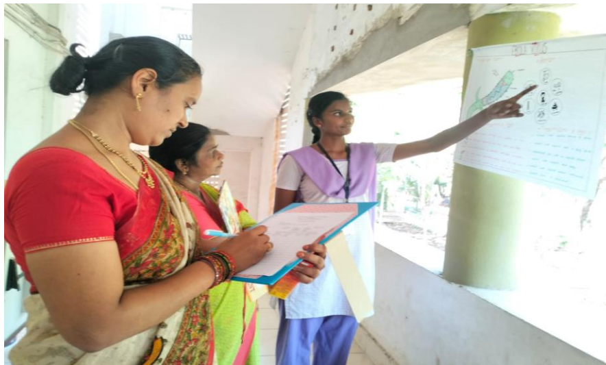
Teachers interaction & guidance to the participants