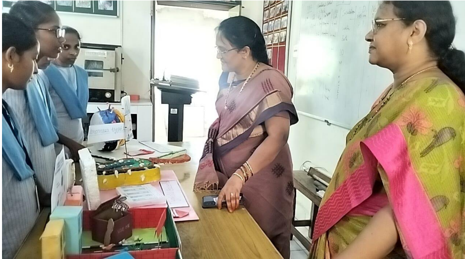
Exhibit explanation by Microbiology Students