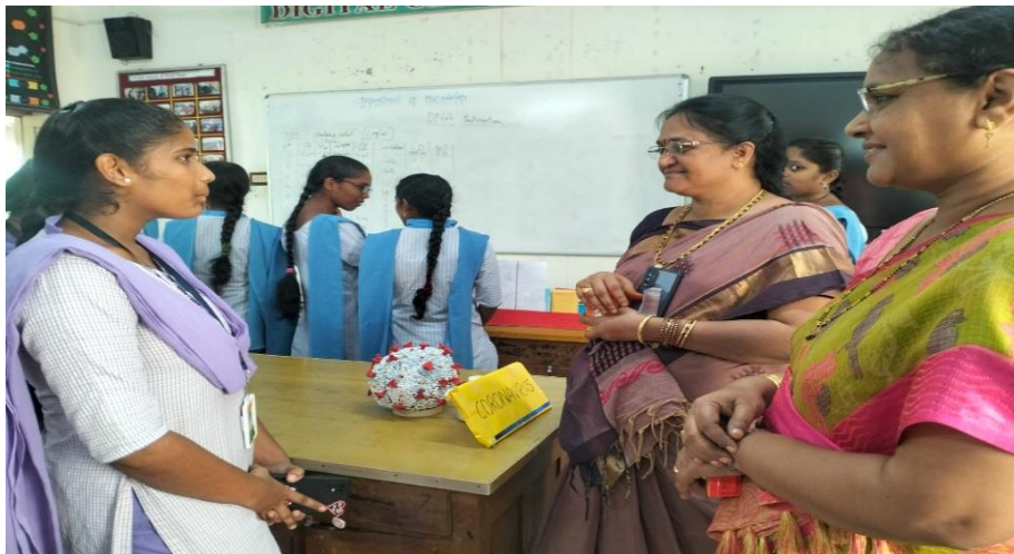
Corona Virus Exhibit explanation by Microbiology Students