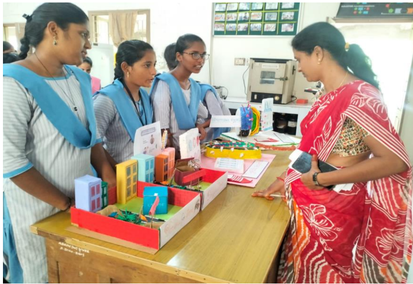
Dengue Exhibit explanation by Microbiology Students