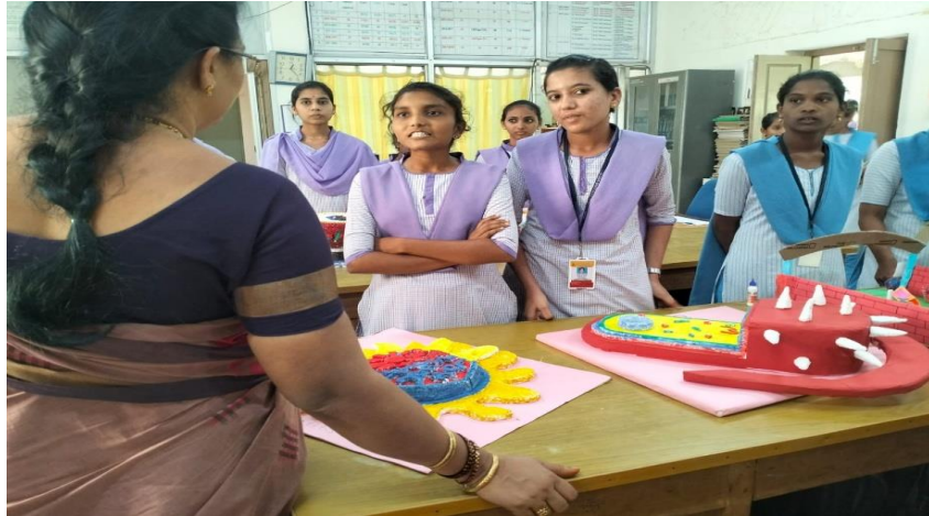
Bacterial Exhibit explanation by Microbiology Students