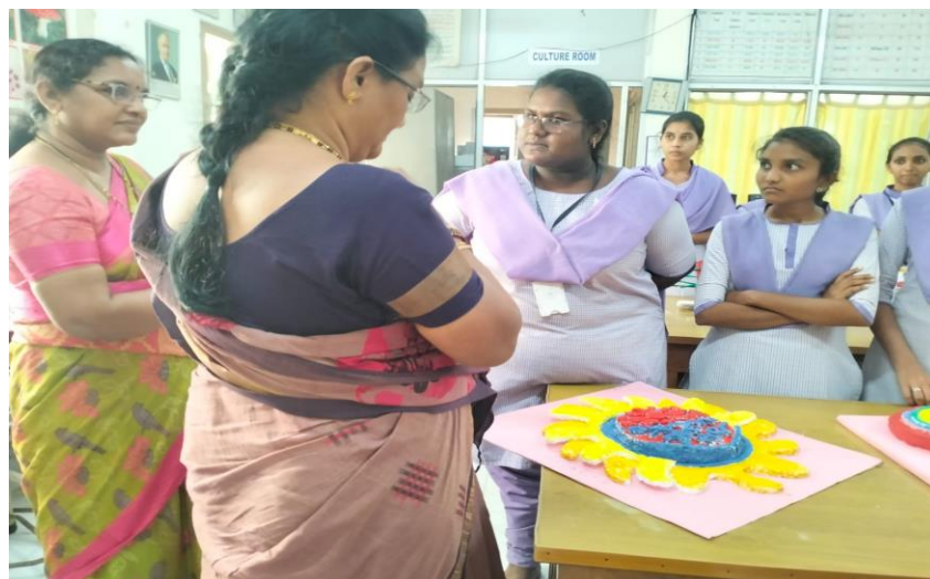
Hepatitis Exhibit explanation by Microbiology Students