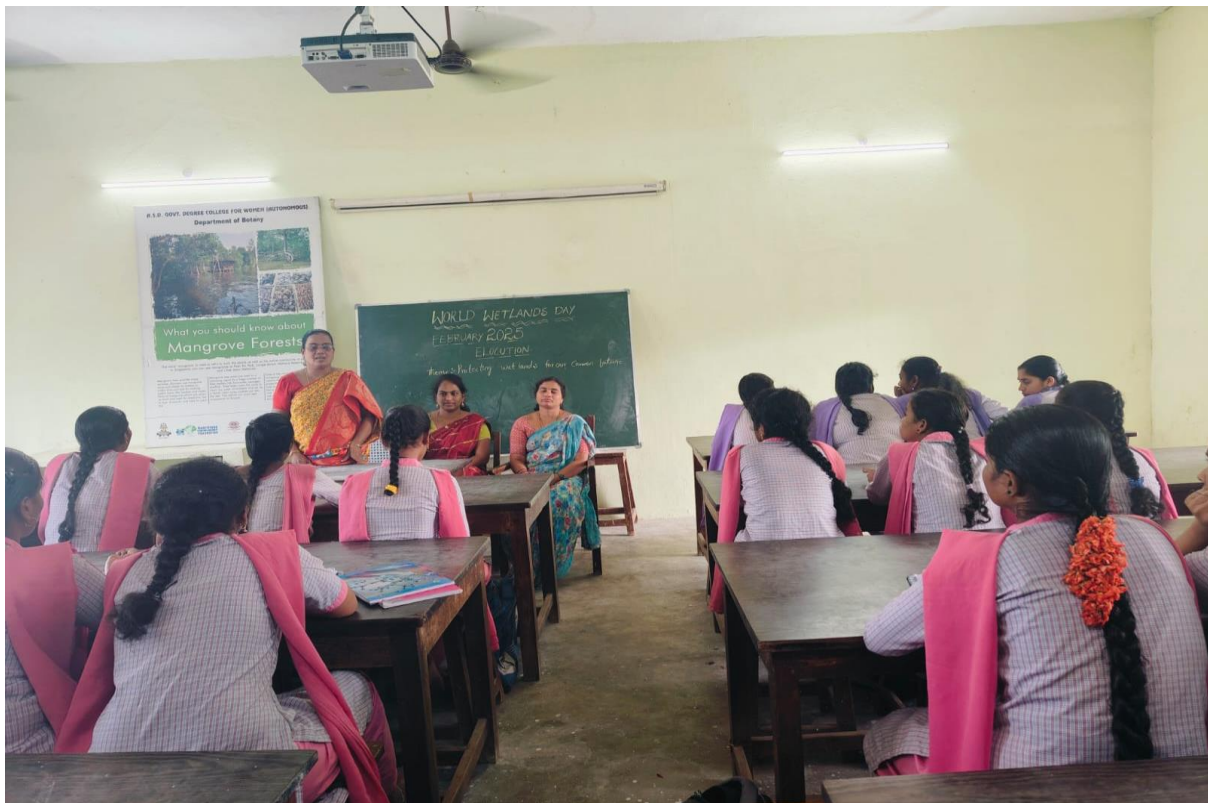
Faculty explaining the importance of world wet lands day to the students