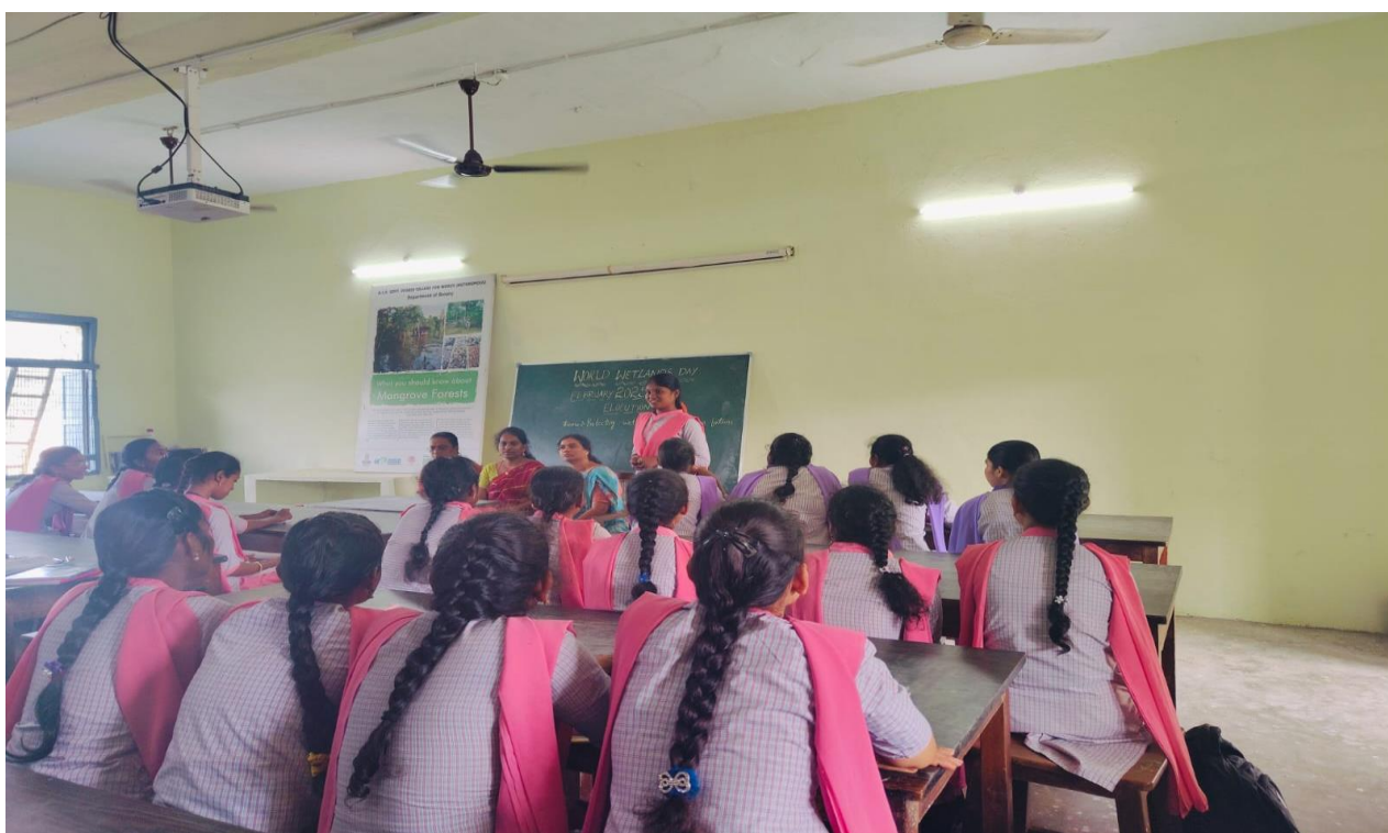
I year Botany Honours students Participate Elocution