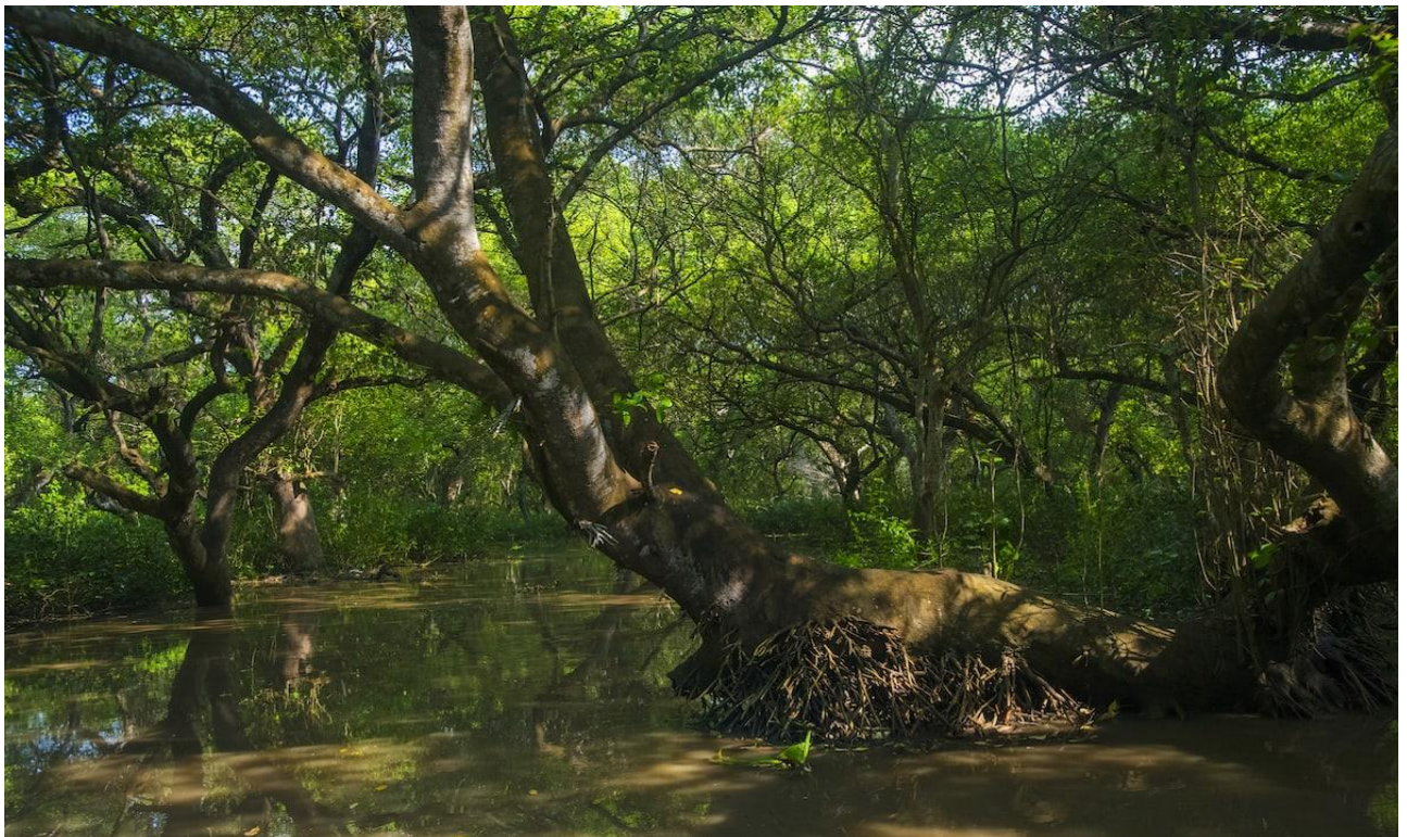
Coringa forest in Kakinada