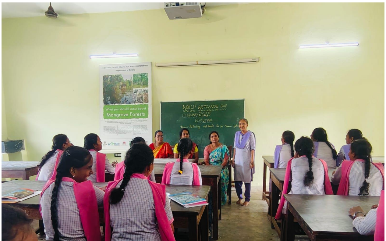
II year Botany Honours students Participating in Elocution