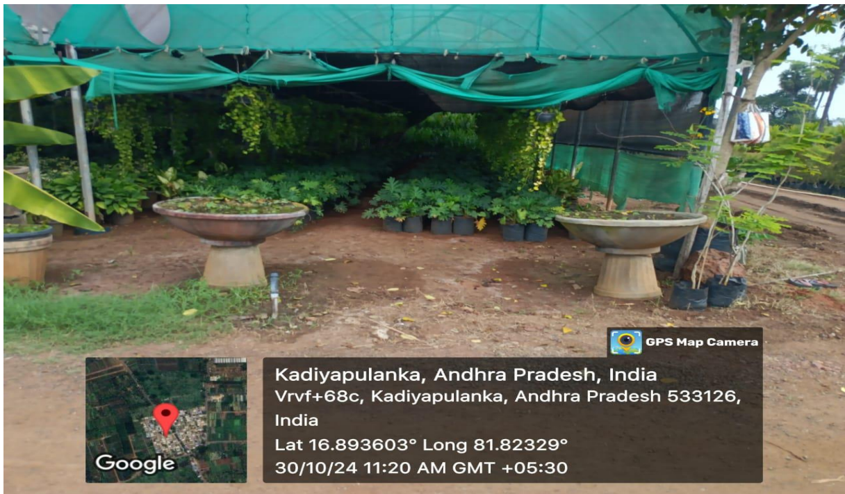
Green House in Satya Deva Nursery