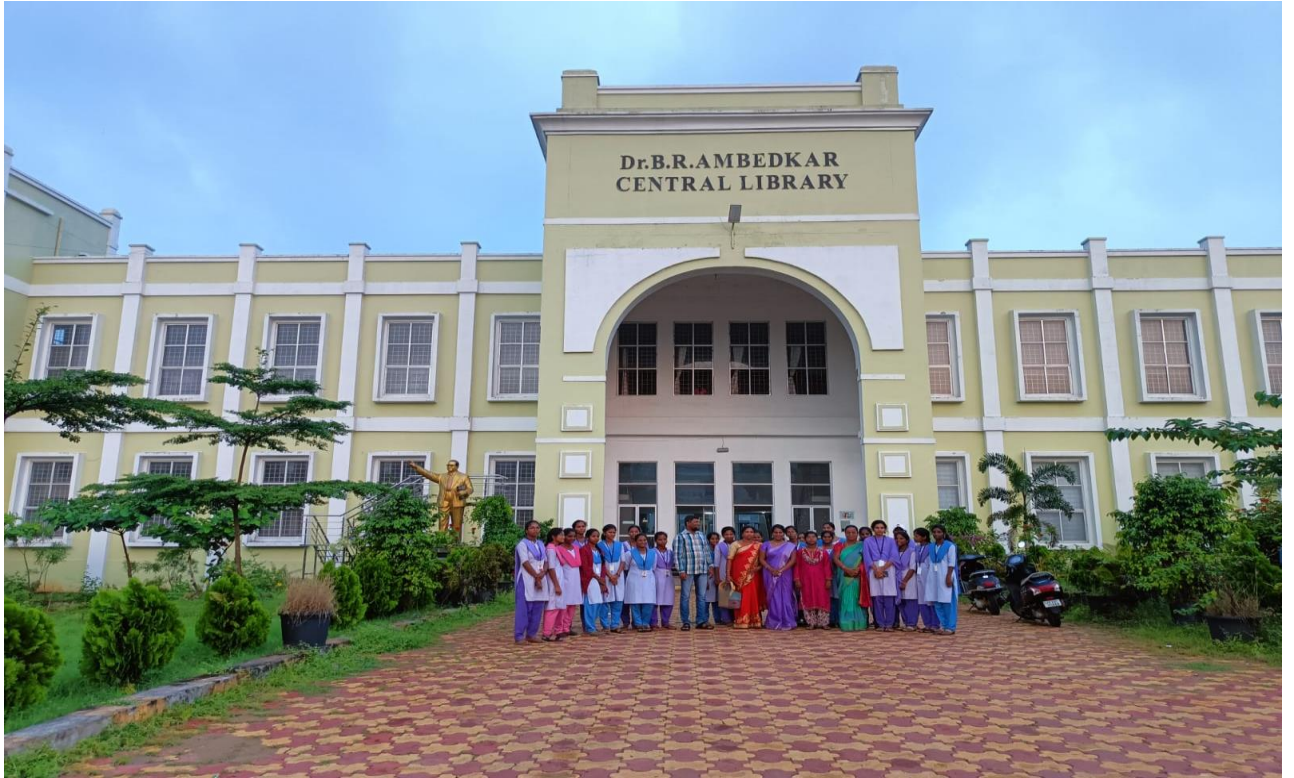
Faculty and Students Visiting Dr.B.R.Ambedkar Central Library in Adikavi Nannaya University Rajahmundry