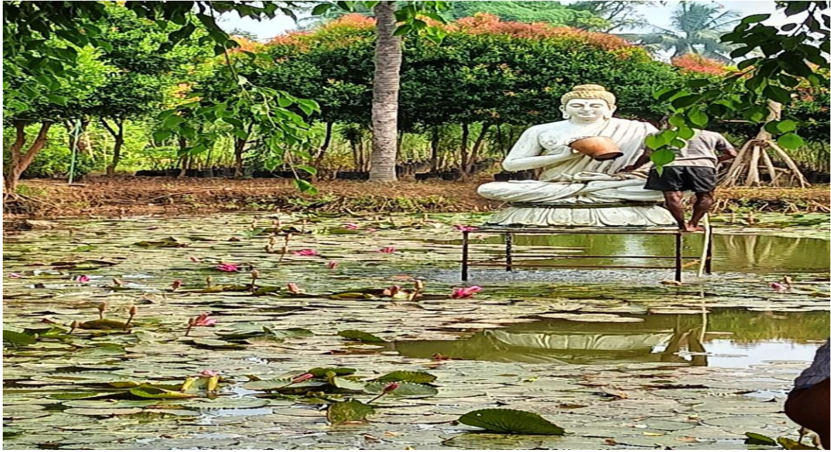
Pond Ecosystem in P.N.R.Satya Deva Nursery