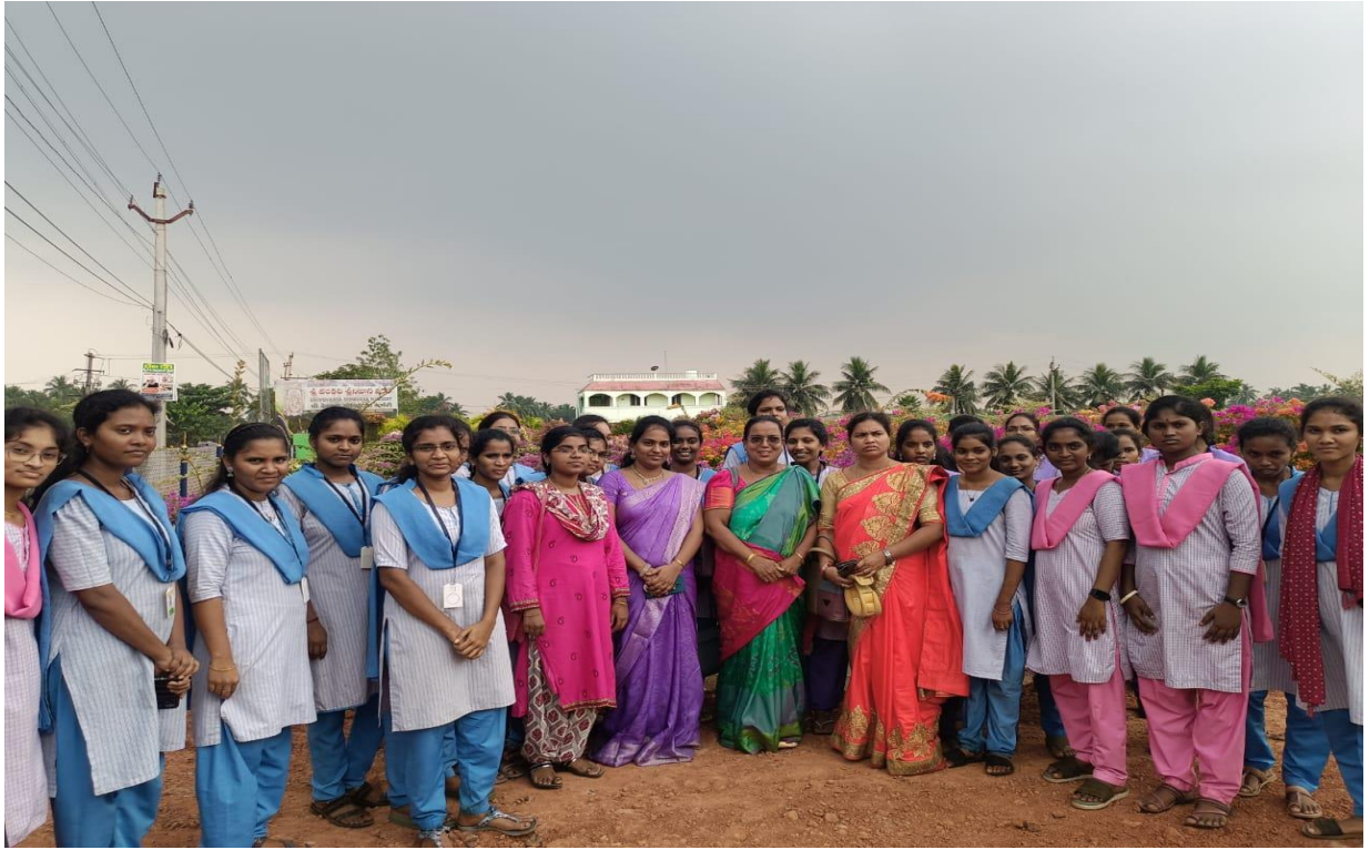
Faculty and Students visiting Viveka Nursery and Sri Venkata Srinivasa Nursery in Kadiyam