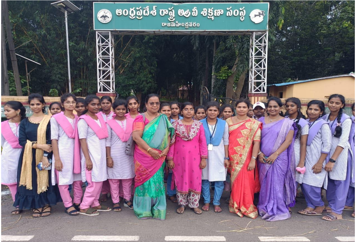
Faculty and Students visiting Andhra Pradesh State Forest Training Centre Rajahmahendravaram