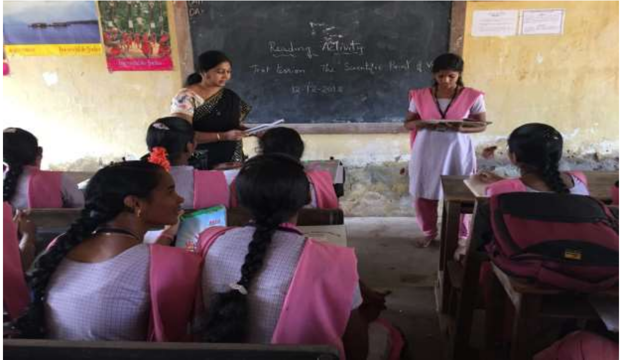
READING ACTIVITIES & ICT ENABLED TEACHING