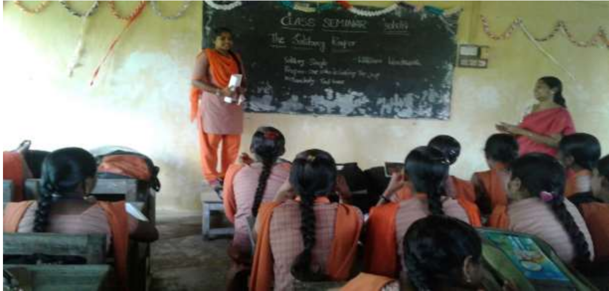
CLASS SEMINARS & QUIZZES