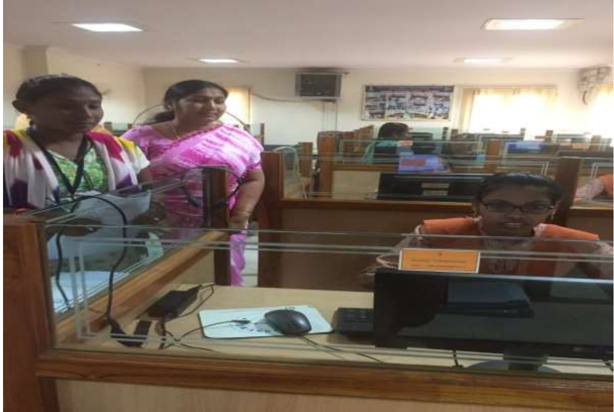
ENCOURAGING STUDENTS TO PARTICIPATE IN CAMPUS DRIVES