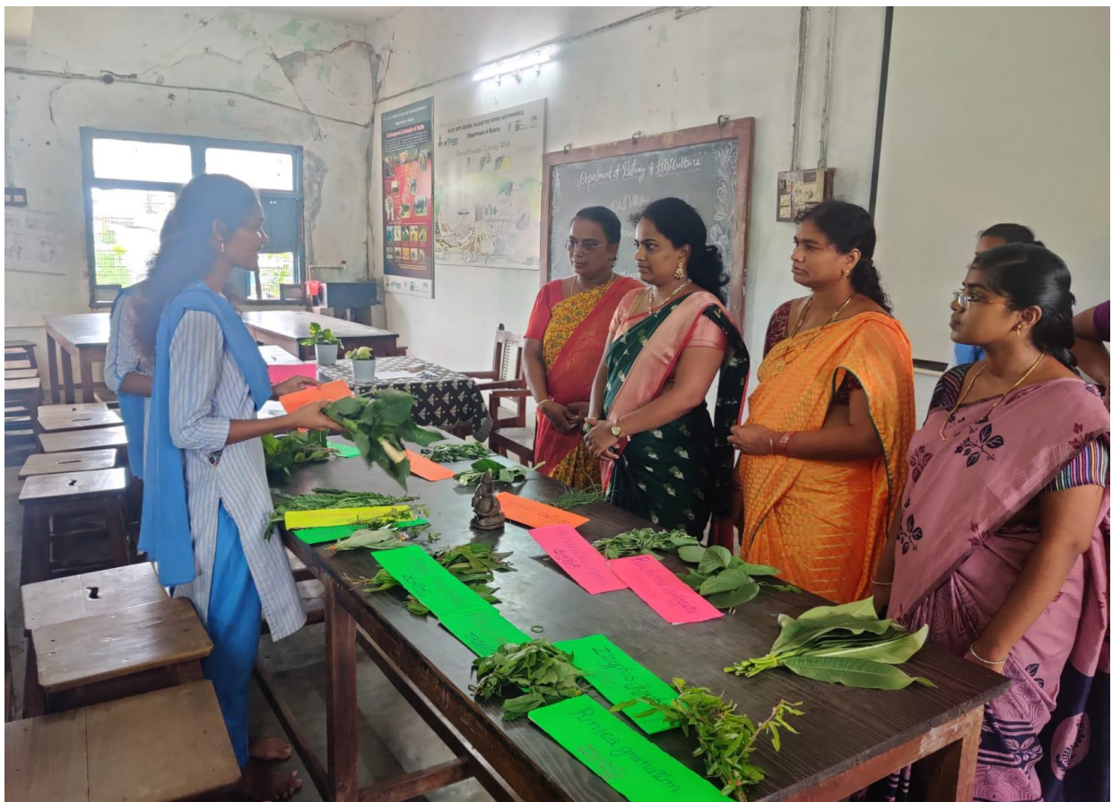
Students explaining about the Importance of Medicinal plants