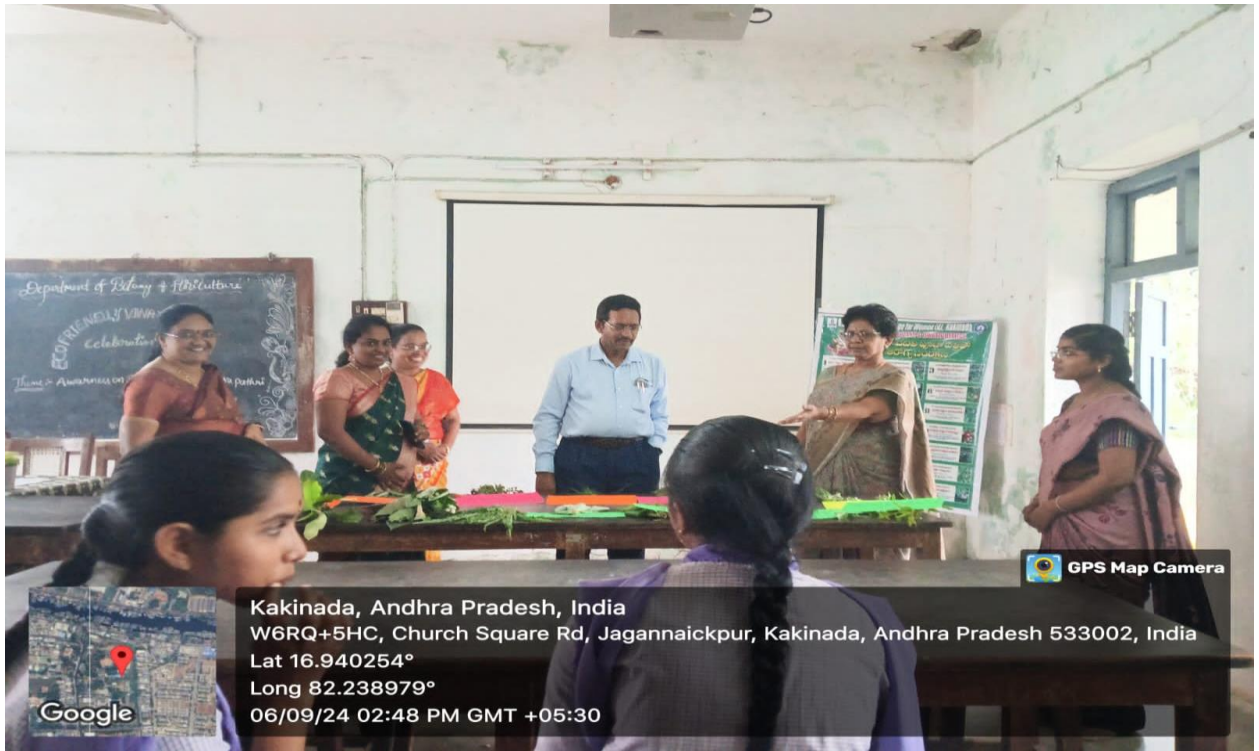
Respected J.D Sir of CCE A.P Pricipal Madam & Vice Pricipal Madam interacting with the students