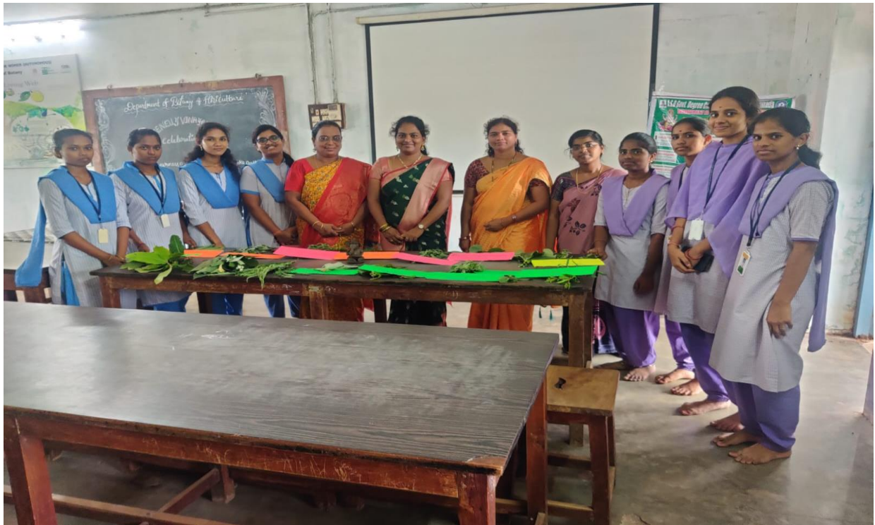
CBHT students and Faculty of the Dept of Botany & Horticulture in Ecofriendly Vinayaka Chavithi patri Exhibition