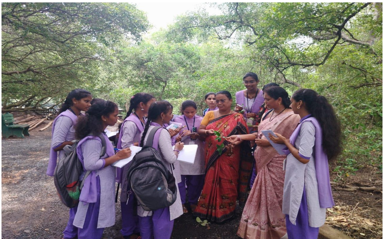
Faculty explaining about Mangrove trees and their Importance