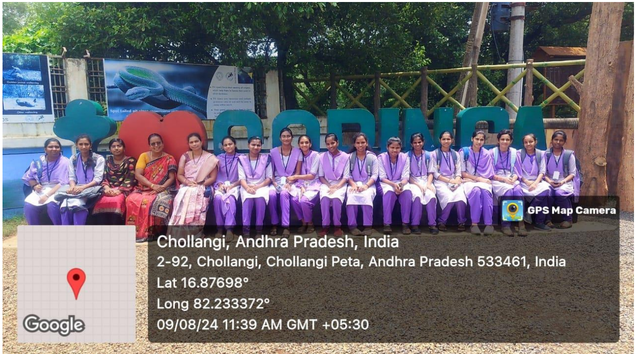
Faculty and students near the entrance gate of Coringa wild life Sanctuary