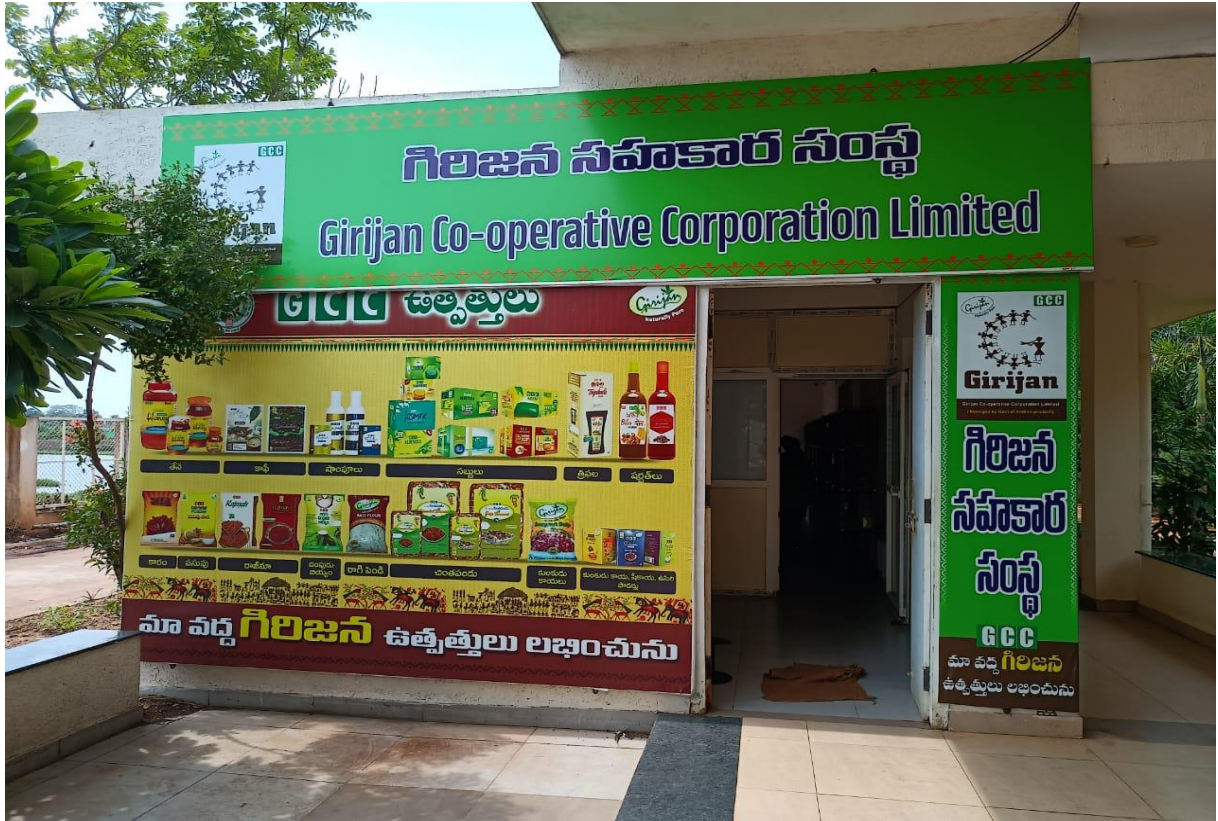
Faculty and Students visiting the stall kept by Girijan Co-Operative Corporation Limited.