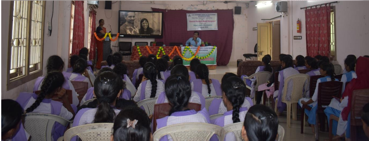
Short video Screening on importance of Financial Planning for women