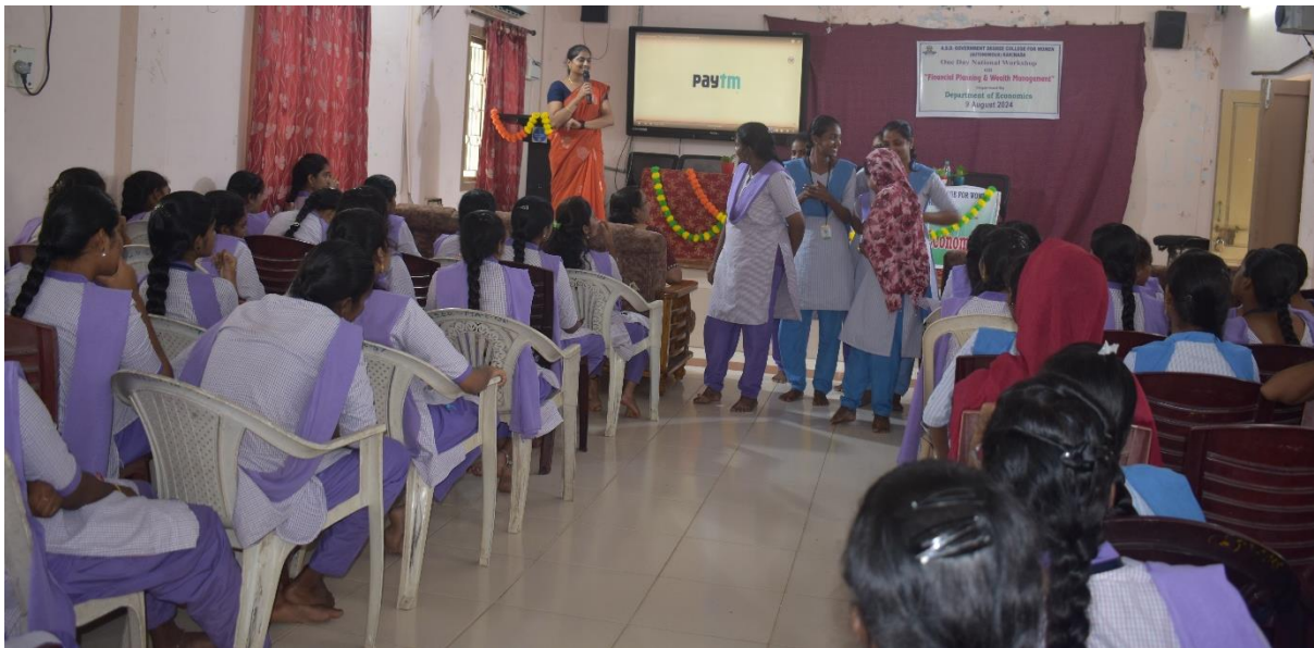
Interactive games on testing the financial literacy of students