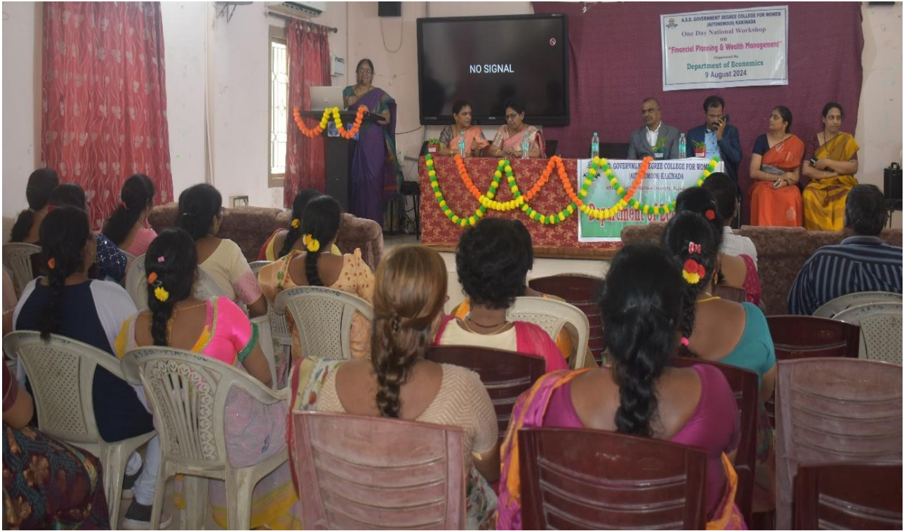
Afternoon session for the Teaching and non teaching faculty