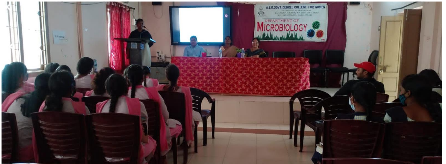
Student Feedback on the session