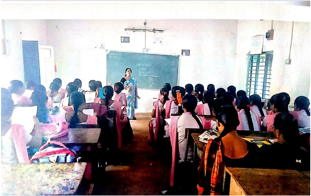
13.9.19 seminar (Departmental project)